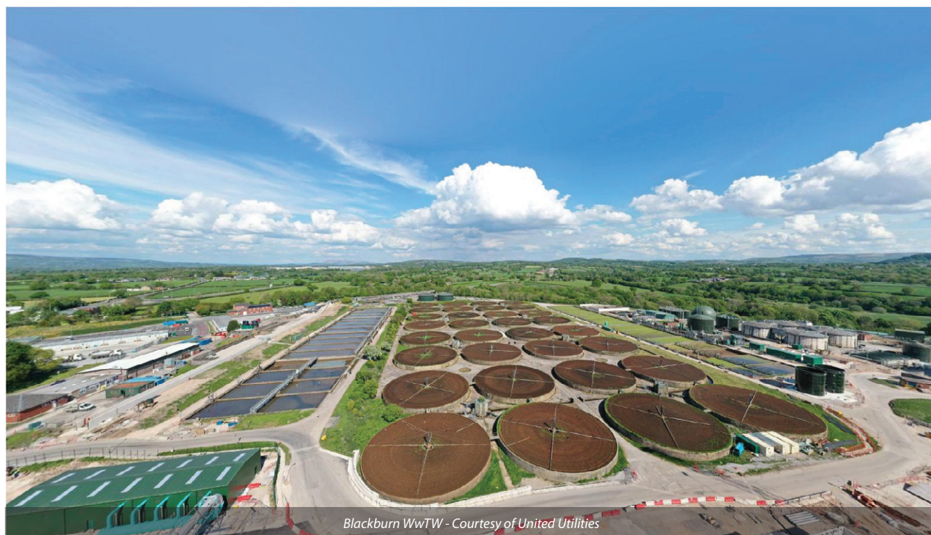
Blackburn WwTW

B lackburn WwTW, located at Samlesbury near Blackburn, serves a population equivalent (PE) of approximately 400,000 and discharges final and storm effluent to watercourses that are tributaries of the River Darwen, feeding into the River Ribble estuary and ultimately into the bathing waters of the Fylde coast in the Irish Sea. Over the last 12 months, construction work at Blackburn has significantly progressed to accommodate AMP7 requirements. This paper is the fourth in a series of case studies detailing the ongoing work at Blackburn, Darwen and the Nab Head sites, following on from those published by UK Water Projects in 2017, 2018 and 2019.