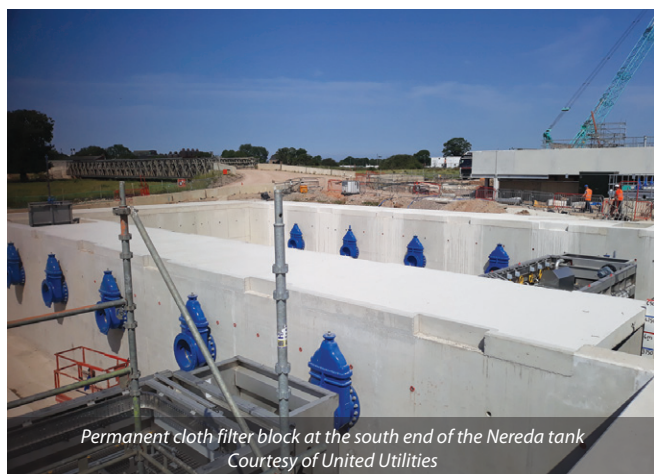
Permanent cloth filter block at the south end of the Nereda tank

Drainage, backfill and landscaping works around the tank has made significant progress in period. Further to the above the blower building has now been constructed including a pipe bridge across the main site access road to reach the Nereda. The building contains 5 (No.) HST™ 30 Turbocompressor Sulzer blowers with a pipework network to each Nereda cell.