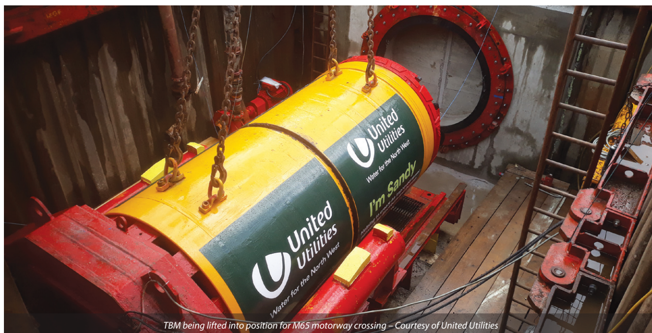
TBM being lifted into position for M65 motorway crossing