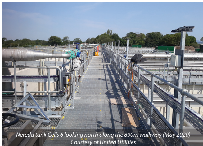
Nereda tank Cells 6 looking north along the 890m walkway (May 2020)