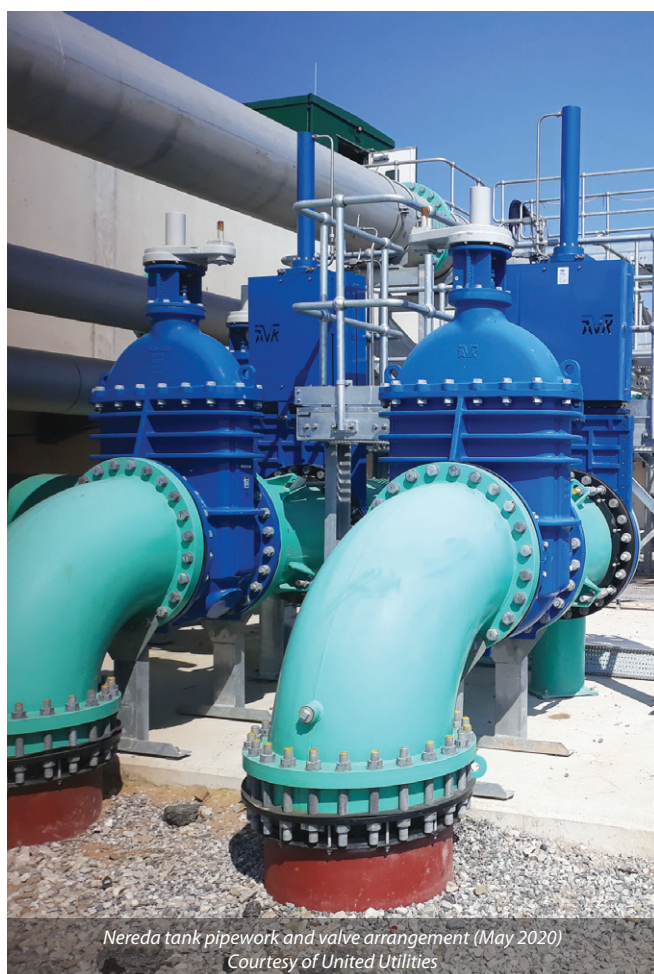
Nereda tank pipework and valve arrangement (May 2020)