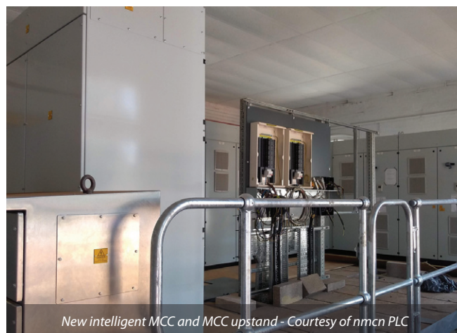
New intelligent MCC and MCC upstand