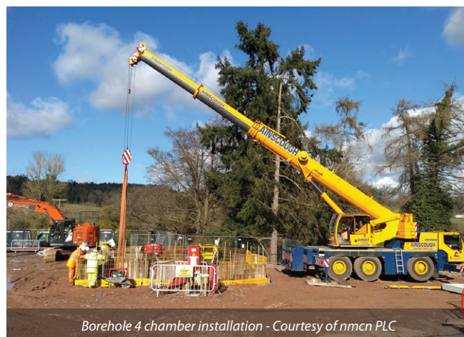
Borehole 4 chamber installation