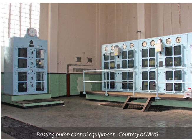
Existing pump control equipment