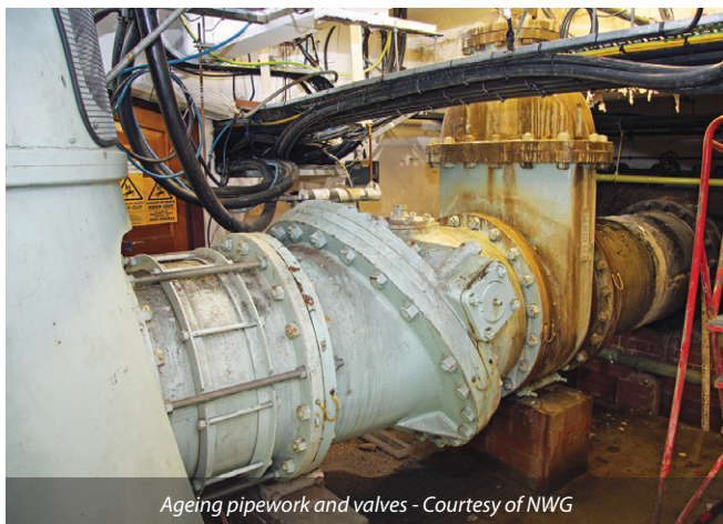
Ageing pipework and valves

A significant amount of I&D had already been completed prior to commencement any pumping station work as the original plan had been to let the contract jointly for all three stations. This enabled the Stratford project to get off to a fast start due to the existence of an outline design.