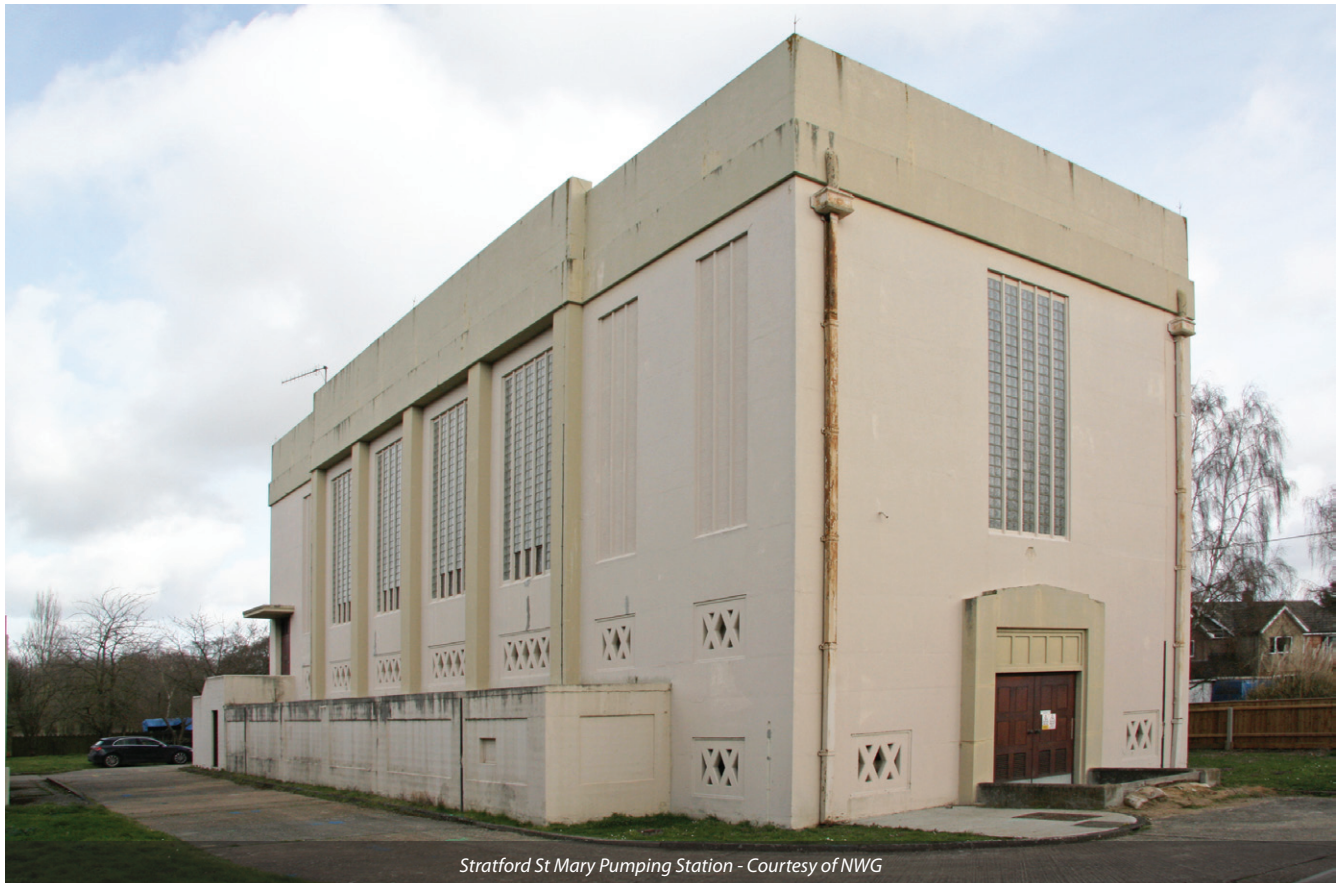
Stratford St Mary Pumping Station

Stratford St Mary Pumping Station is situated adjacent the River Stour in Suffolk. Following an Act of Parliament in 1935, the pumping station was constructed to allow 164 Ml/d of river water to be abstracted and is the primary source of raw water to Abberton Reservoir near Colchester in Essex. The pumping station is owned and operated by Essex & Suffolk Water (ESW), part of the Northumbrian Water Group (NWG). Raw water supplied to the Essex area via the Stour is supplemented by operation of the Environment Agency's Ely Ouse to Essex Transfer System (EOETS), which transfers surplus water (otherwise lost to sea at the Norfolk Wash) to Essex via a series of man-made watercourses, underground pipelines and natural river channels. Demand from the pumping station varies with season but has a maximum daily abstraction licence of 164 Ml/d and is usually in operation most days of the year. The pumping station is key in ensuring the supply of raw water in North Essex and subsequent potable water supplies fed directly from the company's Layer Water Treatment Works.