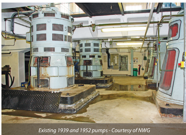
Existing 1939 and 1952 pumps