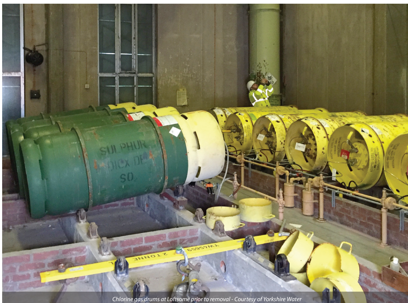
Chlorine gas drums at Loftsome prior to removal

In 2016 Yorkshire Water made the strategic decision to remove all chlorine and sulphur dioxide gas from its Water Treatment Works. This formed part of the Yorkshire Water Safety Improvement Plan as the existing toxic gas disinfection systems were becoming non-compliant with Health and Safety regulations and posed a potential significant risk to employees and customers from an uncontrolled gas escape. It specifically supported the Yorkshire Water 'Keeping you safe and Healthy' performance commitment by replacing hazardous non-compliant gas systems with new sodium hypochlorite and sodium bisulphite chemical dosing systems. The programme was made of 10 projects that ensured the programmes objective was met across 10 different water treatment works.