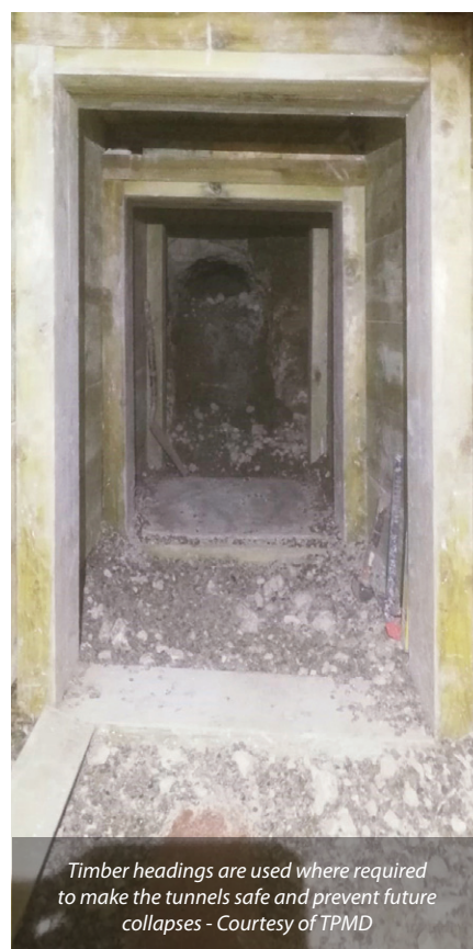
Timber headings are used where required to make the tunnels safe and prevent future collapses