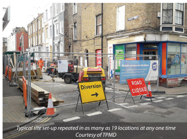
Typical site set-up repeated in as many as 19 locations at any one time