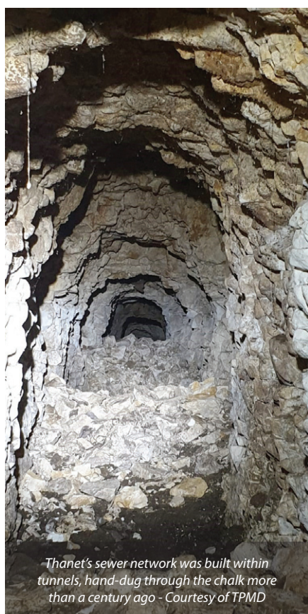
Thanet's sewer network was built within tunnels, hand-dug through the chalk more than a century ago

S outhern Water has started the second phase of its major upgrade of the 100-year-old sewer network across Thanet, Kent. Representing an investment of circa £100m over AMPs 5, 6 and 7, the upgrade aims to maintain the integrity of the sewers, reduce the risk of flooding and protect the environment and chalk aquifer that spans much of the area. The network was constructed more than a century ago by miners who excavated underground tunnels through chalk and built the pipelines within them. These tunnels remain in place, more than 10m deep in some places and continue to act as a conduit for the sewer network. The depth and complex pipeline configuration presents some unusual challenges, not least how the sewers are accessed to complete the work. To overcome these problems, underground confined spaces specialists, trenchless technology and bespoke systems are being used. This article is about the work taking place across Ramsgate and Broadstairs that started in August 2018.