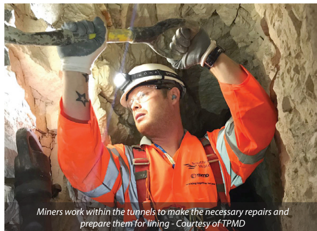
Miners work within the tunnels to make the necessary repairs and prepare them for lining - Courtesy of TPMD