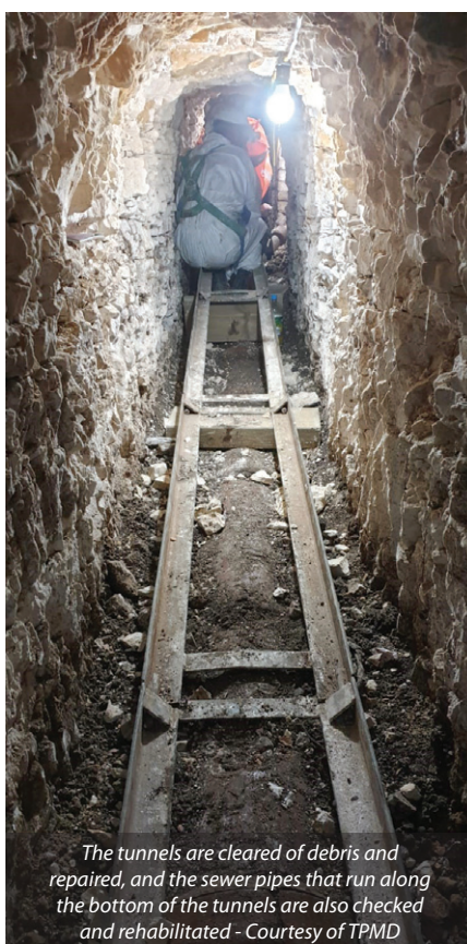
The tunnels are cleared of debris and repaired, and the sewer pipes that run along the bottom of the tunnels are also checked and rehabilitated