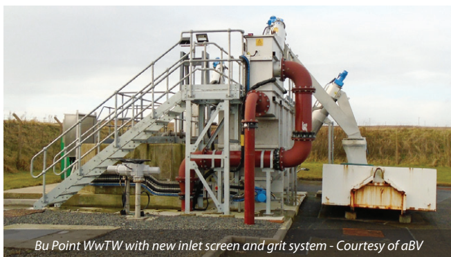
Bu Point WwTW with new inlet screen and grit system