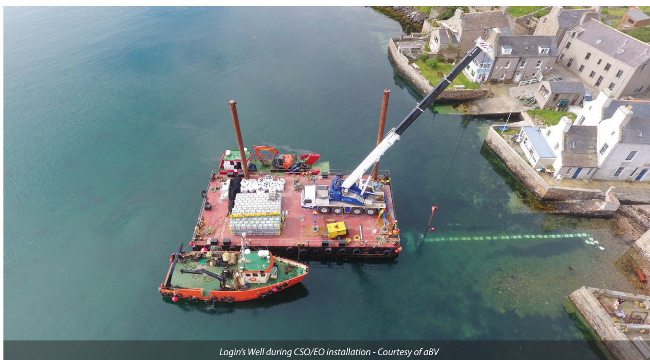
Logis Well during CSO/EO installation

S tromness is a town situated around the sheltered bay of Hamnavoe on the west of Orkney's mainland. It has a population of approximately 2200 inhabitants and a population equivalent (PE) of 2,600, due to the local industry; which is expected to grow to 3,600 in the years ahead. The town has a dramatic and unique vista because of the tightly packed traditional stone buildings that are orientated gable-end on between the adjacent main street and sea front. Situated between the buildings are numerous narrow roads and walkways which allow people to access from the winding main street to the small piers and cobbled boat slips (nousts) which make up the stunning Stromness harbour front.