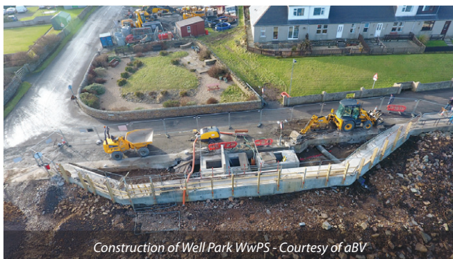
Construction of Well Park WwPS - Courtesy of aBV