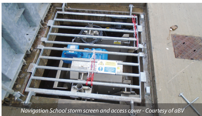
Navigation School storm screen and access cover