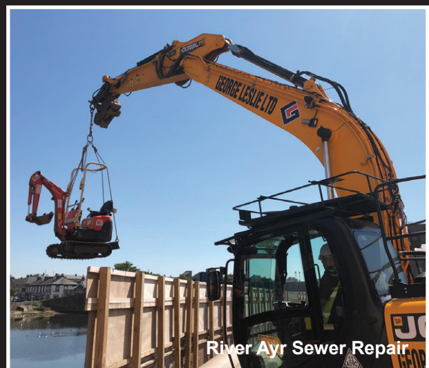
River Ayr Sewer Repair

Blackbyres Road, Barrhead, Glasgow G78 1DU T: 0141 881 9131 F: 0141 881 8265