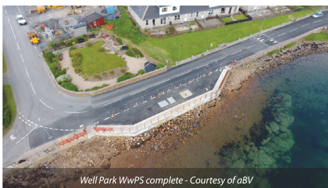
Well Park WwPS complete

in compliance with the required specifications and environmental regulations, InfoWorks database modelling was undertaken. This was carried out by SW's sub consultant Jacobs in 2014, and by using the PE for each of the local sub-catchments, the modelling data was able to establish the new storage volumes required at each of the WwPSs and CSOs. The modelling works were also undertaken to confirm the frequency and spill volumes expected from each CSO, as well as being used to establish the screen type (static or mechanical) required at each site.