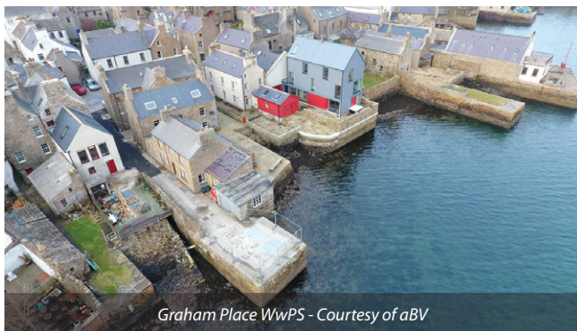
Graham Place WwPS