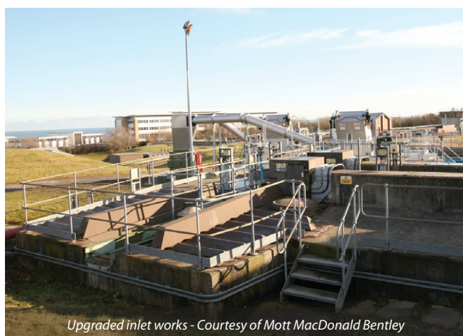
Upgraded inlet works