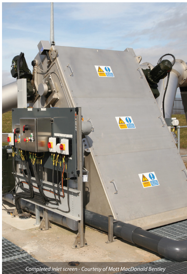
Completed inlet screen