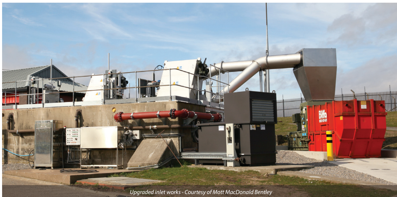
Upgraded inlet works

Seaham Sewage Treatment Works (STW) receives and treats raw sewage from Seaham and the surrounding area. Constructed in phases between 1996 and 2001, the works serve a population of over 23,000 people. The works were originally built to ensure compliance with the Bathing Water Directive, as the site discharges directly into the North Sea via a long sea outfall, within close reach of two recognised bathing beaches. After over twenty years of service, the mechanical assets were being stretched far beyond the original design capacity, causing Northumbrian Water (NW) to incur increasing maintenance costs. In recent years, improvements to storm screens within the sewer network had reduced pollution incidents upstream of the works but had increased the solids loading on the inlet screens and screening system to beyond their original design capacity, accelerating the wear rate and leading to frequent blockages and breakdowns. These failures increase the risk of unconsented discharges into the North Sea and as such, have led to increased reactive maintenance costs.