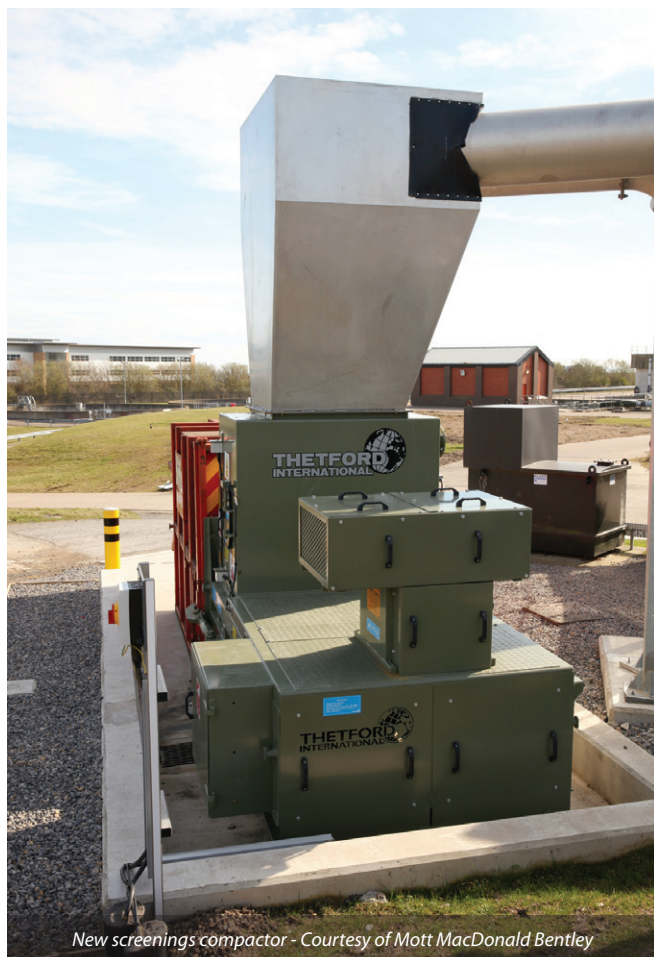
New screenings compactor