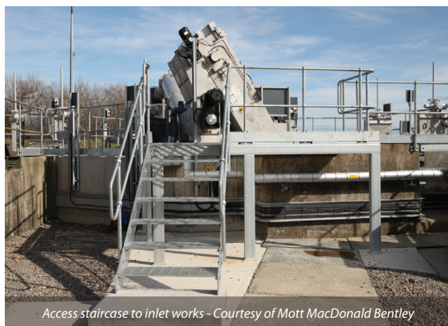
Access staircase to inlet works