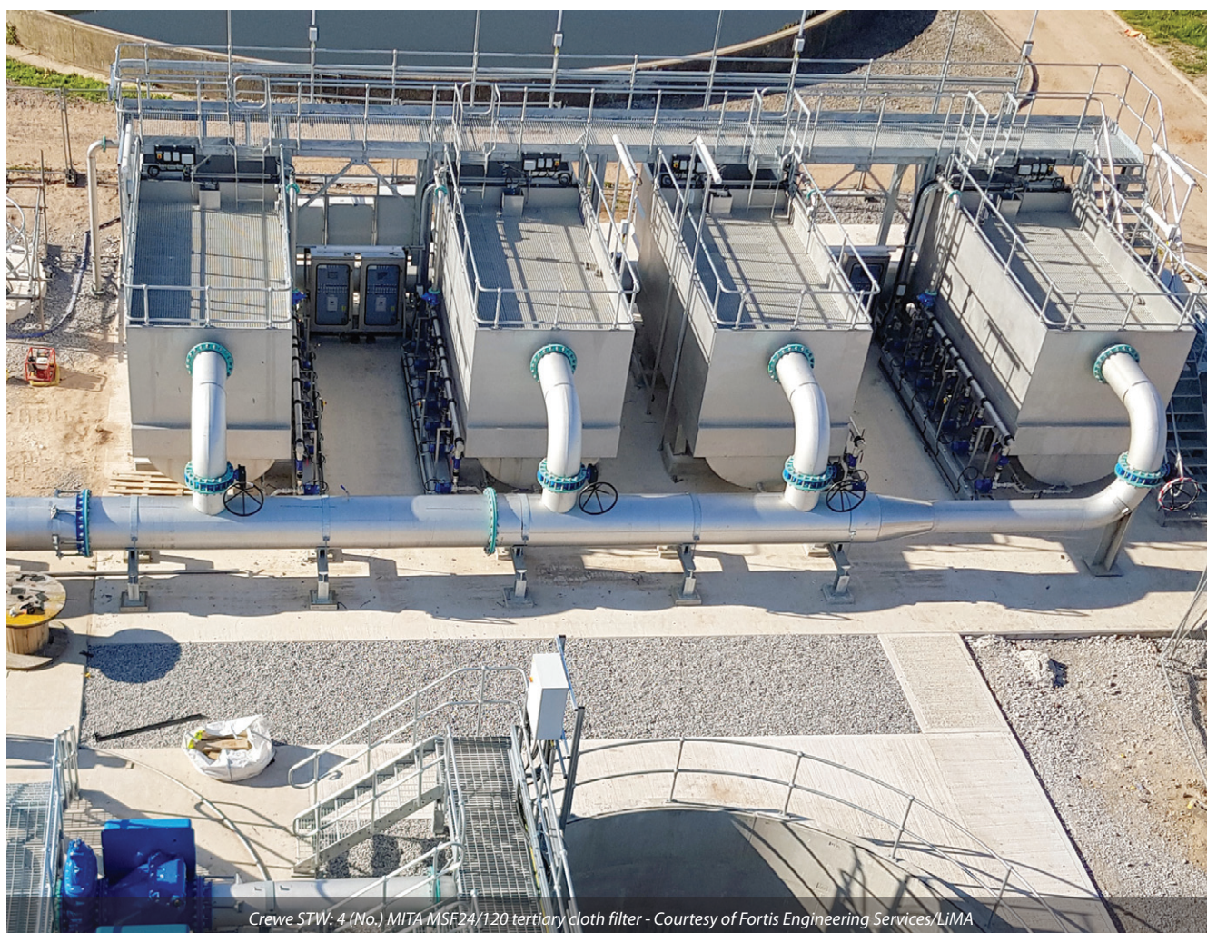
Crewe STW: 4 (No.) MITA MSF24/120 tertiary cloth filter - Courtesy of Fortis Engineering Services/LiMA

Tertiary treatment processes have been used for many years to polish effluent, reducing concentrations of suspended solids (TSS), BOD and ammonia in wastewater and effluent treatment plants. Changes in UK legislation including the introduction of the Water Framework Directive and Shellfish Directive has led to increased interest in nutrient removal (P+N) technology and increasing demand for tertiary treatment in the wastewater treatment process. Tertiary treatment is essential to maintain future compliance with ever tightening Environment Agency standards. Tertiary treatment options available for the municipal market include; cloth filtration, sand filtration, membrane bioreactors and UV disinfection. Using the MITA microfibre cloth filtration process it is possible to achieve TSS concentration as low as 0.5mg/l and consequentially achieve ultra-low total phosphorus (TP) concentration. Compared with other technology the high hydraulic capacity of the units makes it an economical option with a small footprint and low operating and maintenance costs.