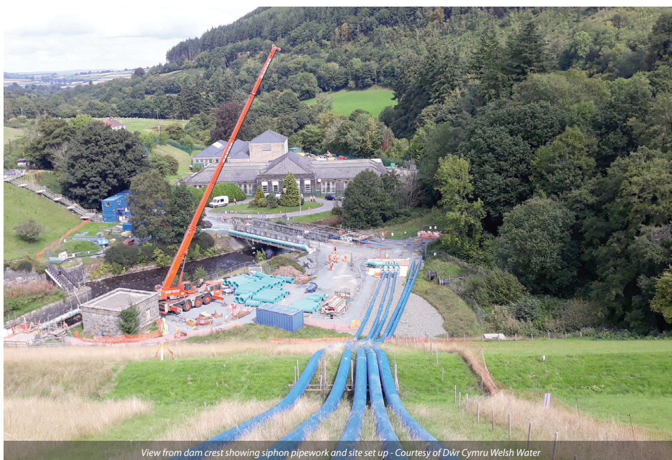
View from dam crest showing siphon pipework and site set up

Talybont is a Large raised reservoir situated in the Brecon Beacons National Park approximately 30 miles north of two of the most populated cities in Wales; namely Cardiff and Newport. Construction of Talybont Dam began in 1932 and ran through until 1939. It was conceived out of a requirement to supply treated water to the rapidly evolving population of the City of Newport. Clay was won locally in a borrow pit upstream of the proposed dam site and stone was quarried locally to provide for masonry blockwork to line the spillway channel and face the tower and upstream face of the embankment.