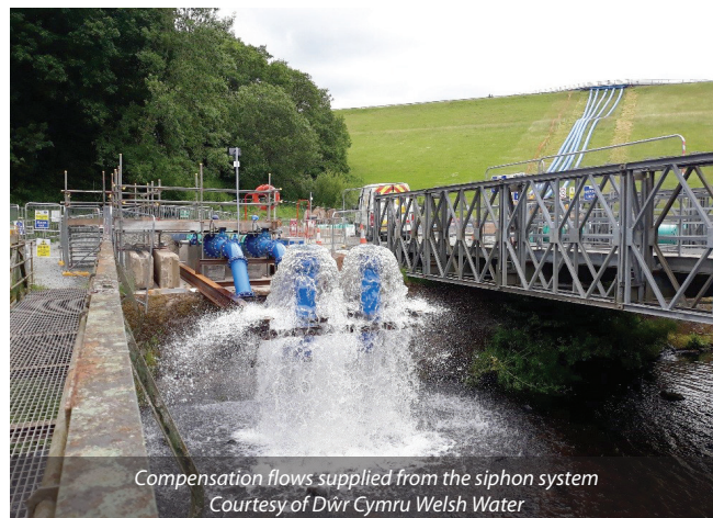
Compensation flows supplied from the siphon system

The editor and publishers would like to thank Dŵr Cymru Welsh Water for providing the above article for publication.