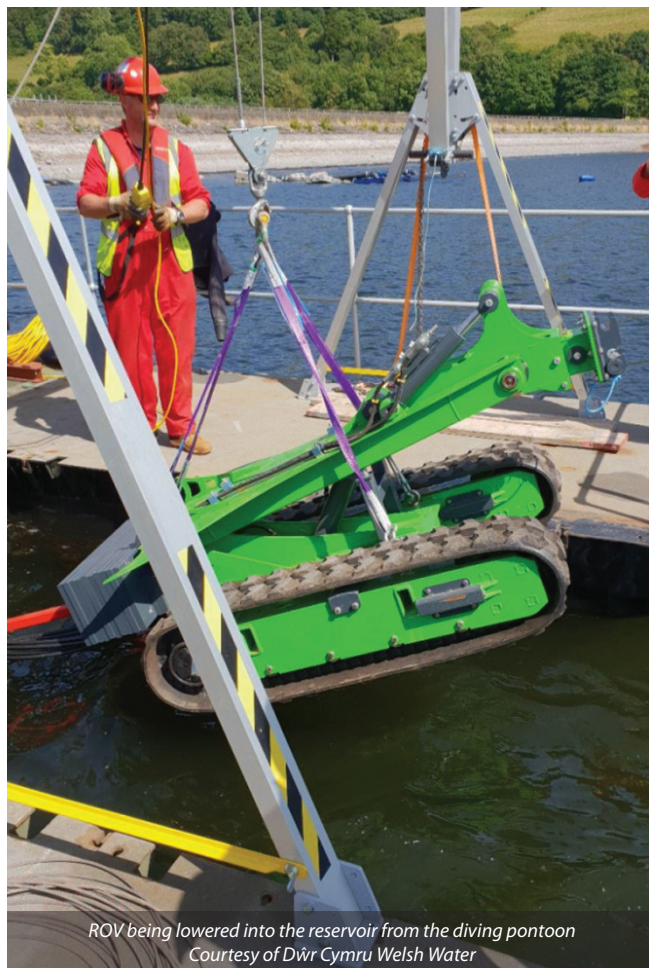
ROV being lowered into the reservoir from the diving pontoon