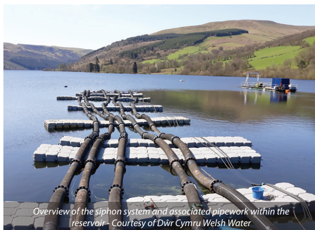
Overview of the siphon system and associated pipework within the reservoir