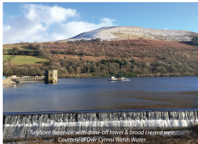
Talybont Reservoir with draw-off tower & broad crested weir