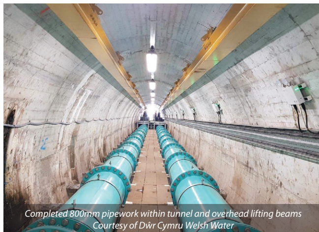
Completed 800mm pipework within tunnel and overhead lifting beams