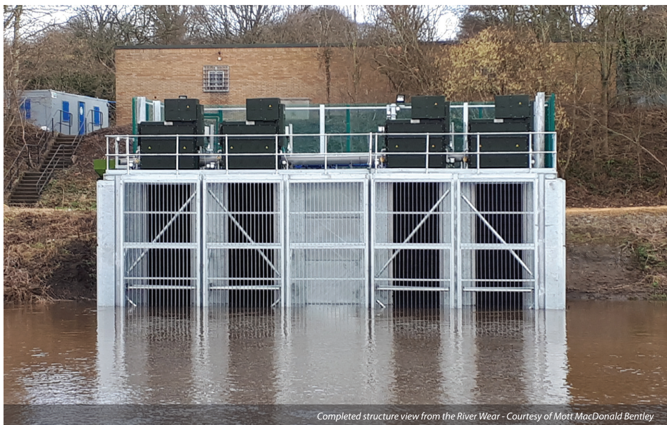
Completed structure view from the River Wear

The installation of new eel and fish friendly screens at Northumbrian Water Group's (NWG) Lumley Raw Water Pumping Station (RWPS) was the culmination of collaborative working between multiple stakeholders, to transform the screening methodology in an environmentally sensitive location. The final solution provides an option that presents immediate environmental benefits to aquatic life, with low on-going power consumption, and significantly reduced operator requirements for years to come. The project is part of a batch of four schemes, all installing purpose-built fish-exclusion, fish recovery and return screens at existing pumping stations across the Northumbrian region.