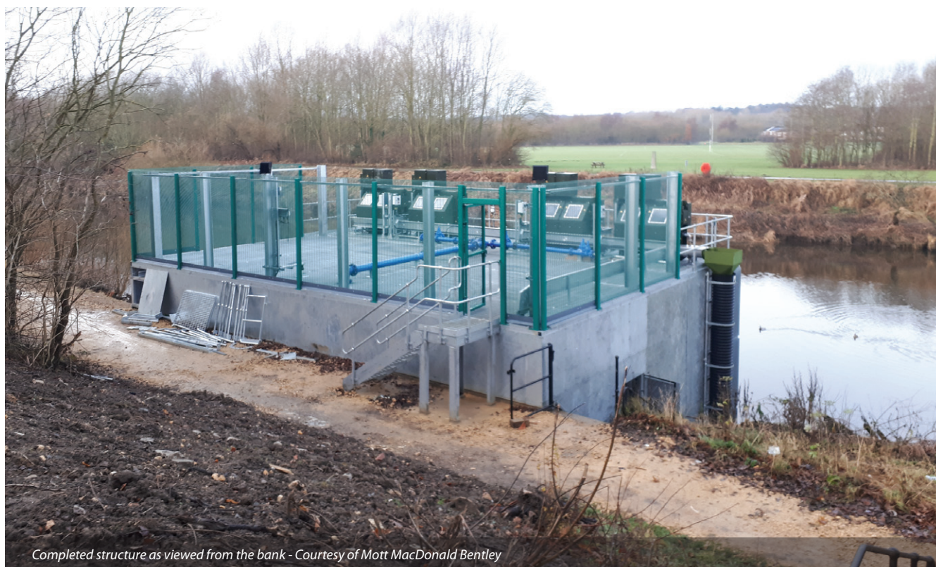
Completed structure as viewed from the bank