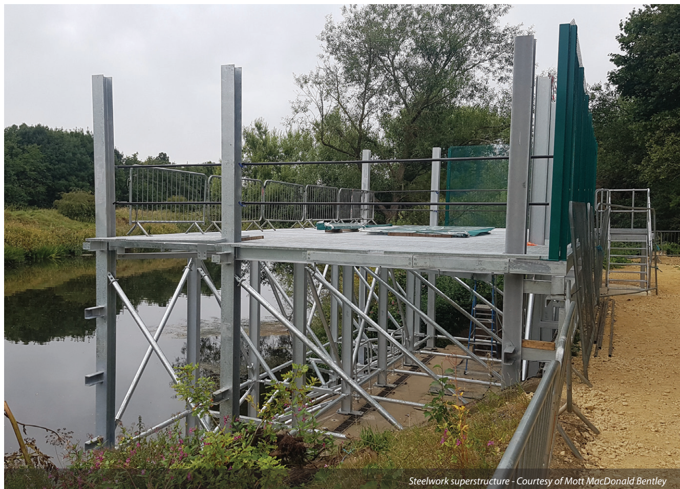
Steelwork superstructure - Courtesy of Mott MacDonald Bentley

Key relationships were formed between the steelwork and screen suppliers, ensuring all four screens were comfortably installed 'cartridge style' without on-site modifications.