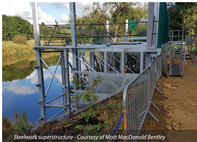
Steelwork superstructure

The D&C contract was delivered for £1.15m, beating the target cost estimate of £1.25m. The savings can be attributed to strong collaboration between all parties, identifying key risks and constraints and confronting them as a team.