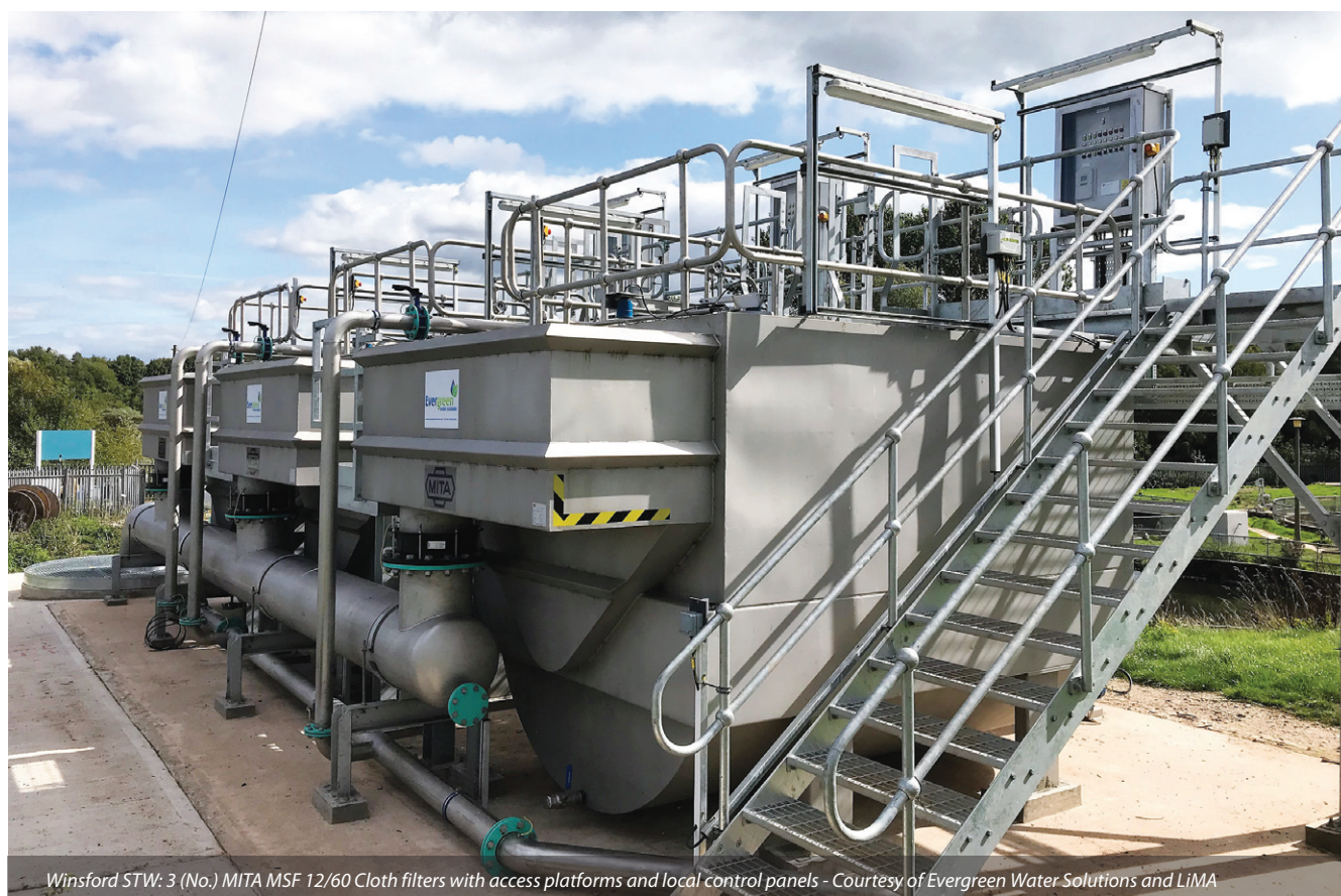
Winsford STW: 3 (No.) MITA MSF 12/60 Cloth filters with access platforms and local control panels

Tertiary treatment processes have been used for many years to polish effluent, reducing concentrations of suspended solids (TSS), BOD and ammonia in WwTW effluent plants. Changes in UK legislation including the introduction of the Water Framework Directive and Shellfish Directive has led to increased interest in nutrient removal (P+N) technology and increasing demand for tertiary treatment in the wastewater treatment process. Tertiary treatment is essential to maintain future compliance with ever tightening Environment Agency standards. Tertiary treatment options available for the municipal market include; cloth filtration, sand filtration, membrane bioreactors and UV disinfection. Using the MITA Microfibre Cloth Filtration Process it is possible to achieve TSS concentration as low as 1mg/l and consequentially achieve ultra-low TP concentration. Compared with other technology the high hydraulic capacity of the units makes it an economical option with a small footprint and low operating and maintenance costs.