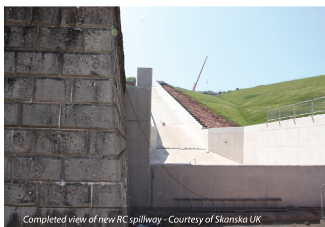
Completed view of new RC spillway

comprising of two concrete cores, excavation and sampling of the underlying material. Contact grouting works was carried out to fill voids and improve near-surface rock mass quality under the spillway base slab.