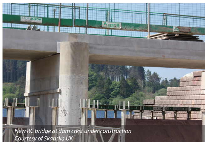
New RC bridge at dam crest under construction

Stilling basin: Investigations to the stilling basin was undertaken to confirm the base slab thickness and foundation material,