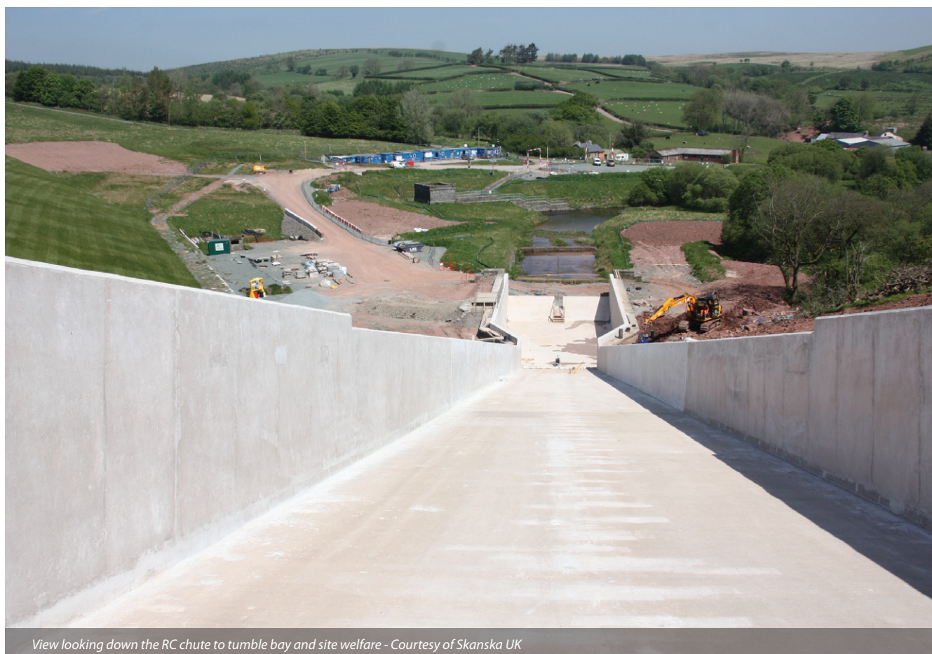
View looking down the RC chute to tumble bay and site welfare

U sk Reservoir in Brecon is situated south east of Llandovery and approximately 5km to the west of Sennybridge. The reservoir is an existing 12.3Mm 3 reservoir in the Brecon Beacons National Park in South Wales. It is impounded by a 31m high, 480m long embankment dam with a clay core, which was constructed in 1955. The reservoir has a surface area of 1.12km 2 when filled to its top water level of 306.35mAOD. The reservoir is fed by both direct and indirect catchments and thereafter supplies raw water to Portis and Bryngwyn Water Treatment Works. There are no further reservoirs upstream.