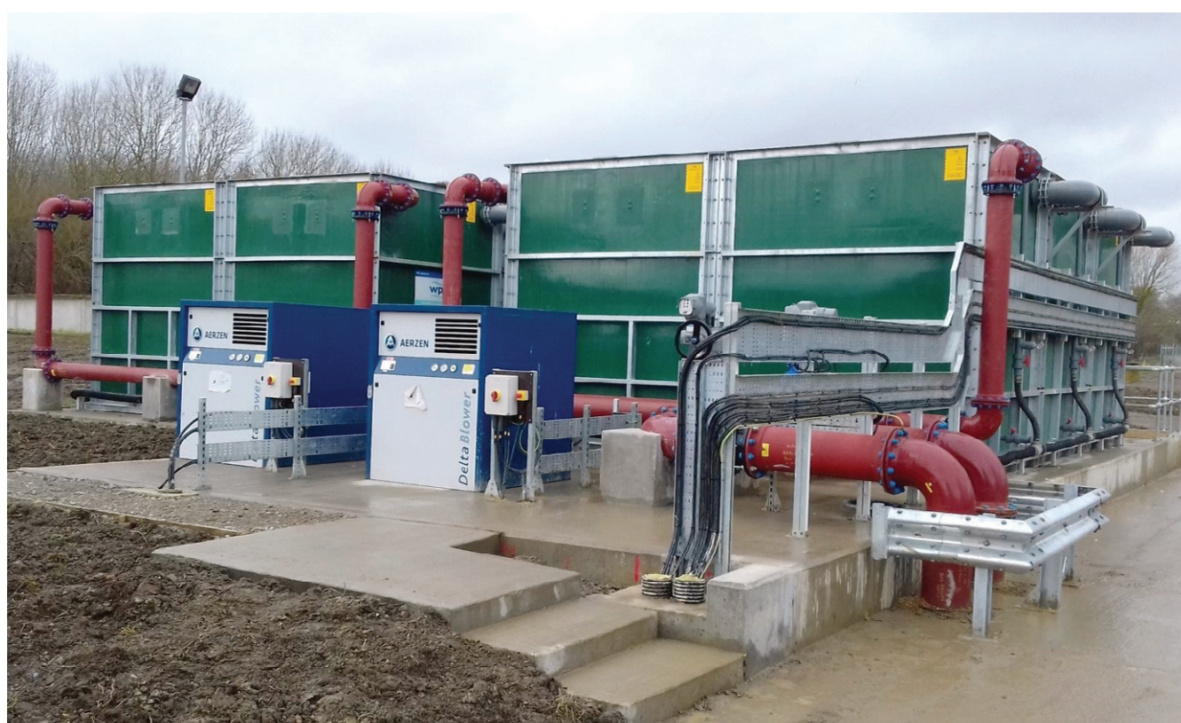
Front view of the SAF units showing the outlet pipework, blowers and cable tray. The team incorporated concrete steps to the slab to allow safe access to the blowers during future maintenance

Stanbridgeford Sewage Treatment Works (STW), lies approximately one mile south of the village of Stanbridge in Bedfordshire and as of 2016, the population equivalent (PE) of the works was 15,305 and the domestic population served was 15,051. The treatment works discharge into the adjacent Ouzel Brook, a tributary of the River Great Ouse. Regulations from the Environment Agency (EA) state that the level of ammonia in wastewater must be less than 1mg/l for it to be discharged safely into waterways. Although nitrates are naturally occurring in water, excess amounts are detrimental to aquatic ecosystems; causing a rapid increase in the population of algae, which deplete oxygen levels in the water and release toxins. This can be fatal for marine life. Additional treatment systems were therefore required at Stanbridgeford to oxidise ammonia into less harmful nitrates.