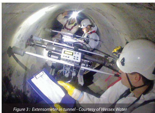
Figure 3 : Extensometer in tunnel