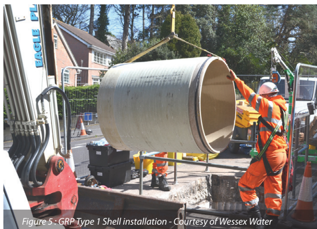
Figure 5 : GRP Type 1 Shell installation - Courtesy of Wessex Water

ranging from 10 to 100 kN. Fine sensors (Extensometers), measure the deformation arising directly in the area of the pressure plates and at a distance of approximately one metre in front and behind these points to record the three-dimensional deformation. Despite the high forces applied, the automatic control of the pressure cylinder prevents any overloading and damage to the tunnel walls. The actual deformations measured are, at most 0.5mm (Figure 2).