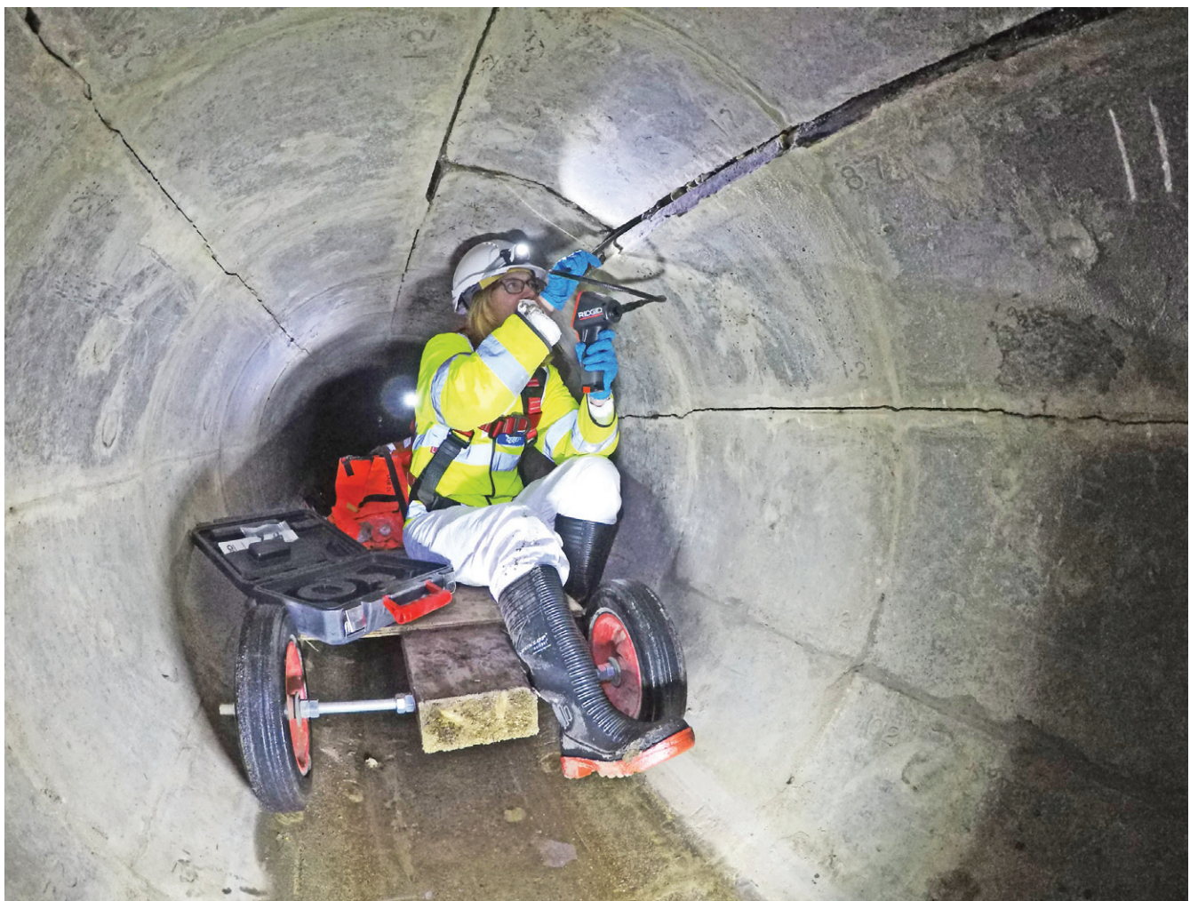
Figure 1: Hydraulic overloading causing liner displacement

The UK has a tremendous legacy of tunnel construction over the last 150 years, from Joseph Bazalgette's brick sewers in London, through to reinforced concrete designs based upon early engineers such as François Hennebique. Wessex Water has a considerable cumulative metreage of tunnels constructed over the last 150 years, up to 5 metres in diameter, serving over a million customers in Bristol, Bath and the Poole/Bournemouth/Christchurch conurbation. As part of a structural survey programme, Wessex Water looked for a predominantly non-destructive testing (NDT) method of analysing the structural capabilities of the tunnels and understanding their longevity. In 2016 Wessex Water became the first UK WaSC to use the IKT MAC System (Mécanique d'Auscultation de Conduits) for such an assessment of the structural condition, of a man-entry concrete sewer in Bournemouth, and its host geology.