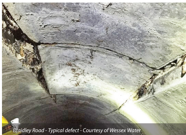
Braidley Road - Typical defect