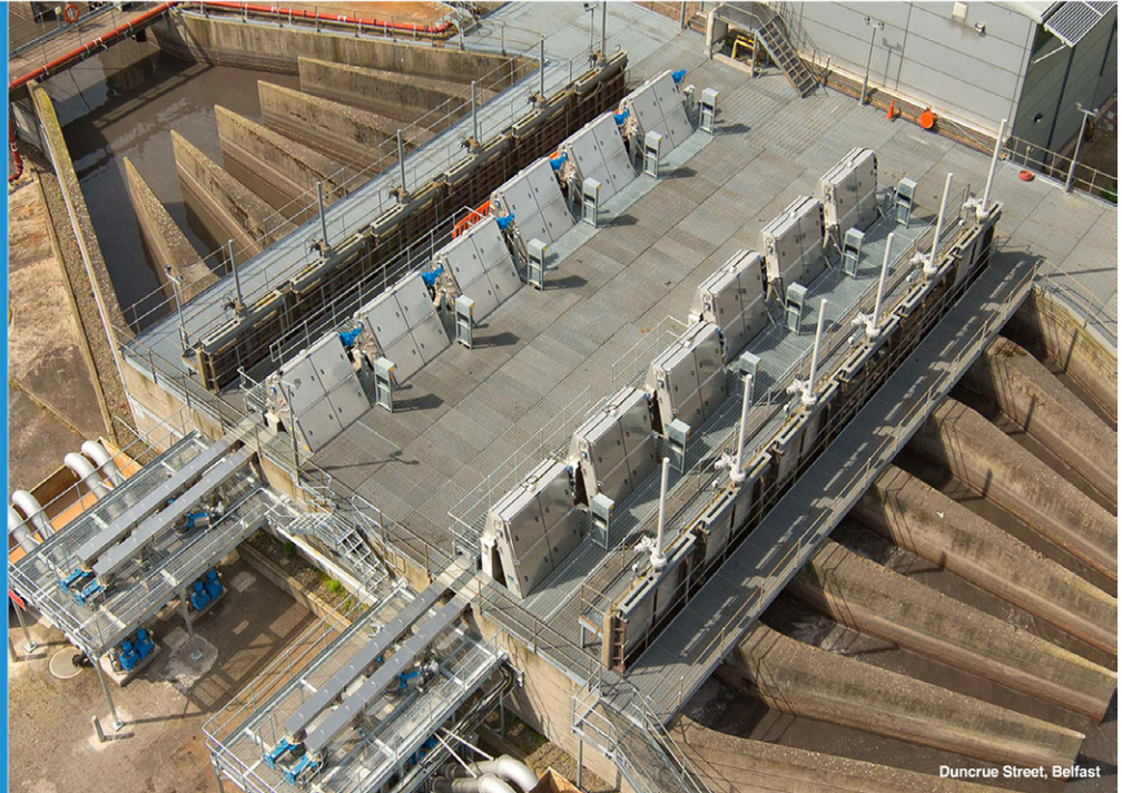
Duncrue Street, Belfast

T. +44 1249 765000 E. rotamat@huber.co.uk www.huber.co.uk