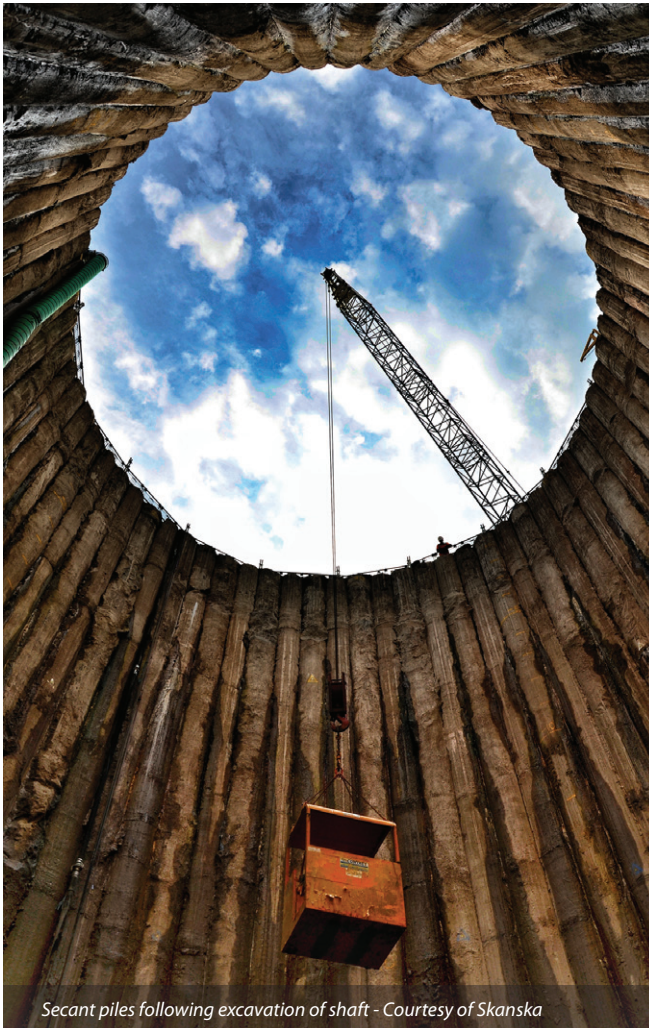
Secant piles following excavation of shaft

Burnham Jetty is the only 'poor' bathing water site in the Wessex Water region as categorised by the EU Revised Bathing Water Directive. Wessex Water has been working with the Environment Agency and committed £39 million to 12 schemes to improve this rating. Bristol Road Sewer Pumping Station (SPS) and Combined Sewer Overflow (CSO) rebuild is one of the major aspects of these works at £6.6m.