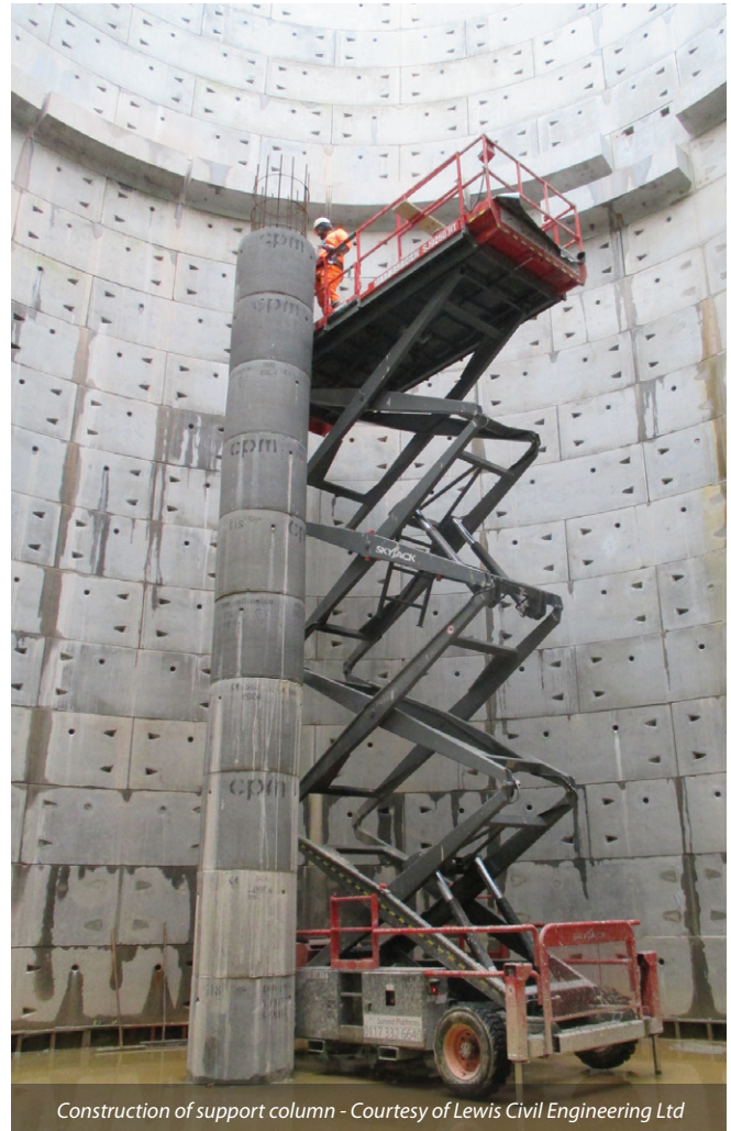
Construction of support column