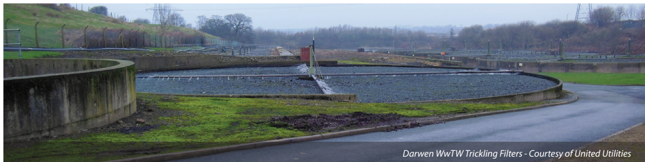
Darwen WwTW Trickling Filters

This appeal was successful leading to a time saving of approximately 12 months and enabling earlier mobilisation for construction.