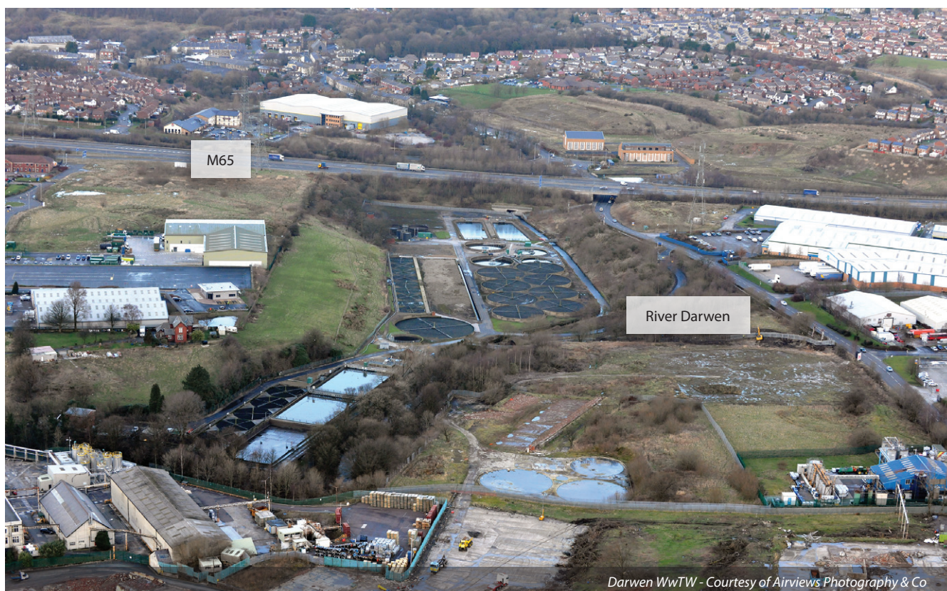
Darwen WwTW