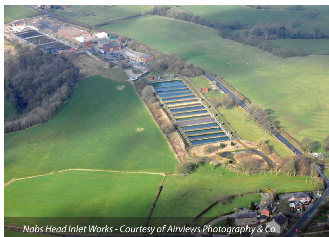
Nabs Head Inlet Works - Courtesy of Airviews Photography &amp; Co