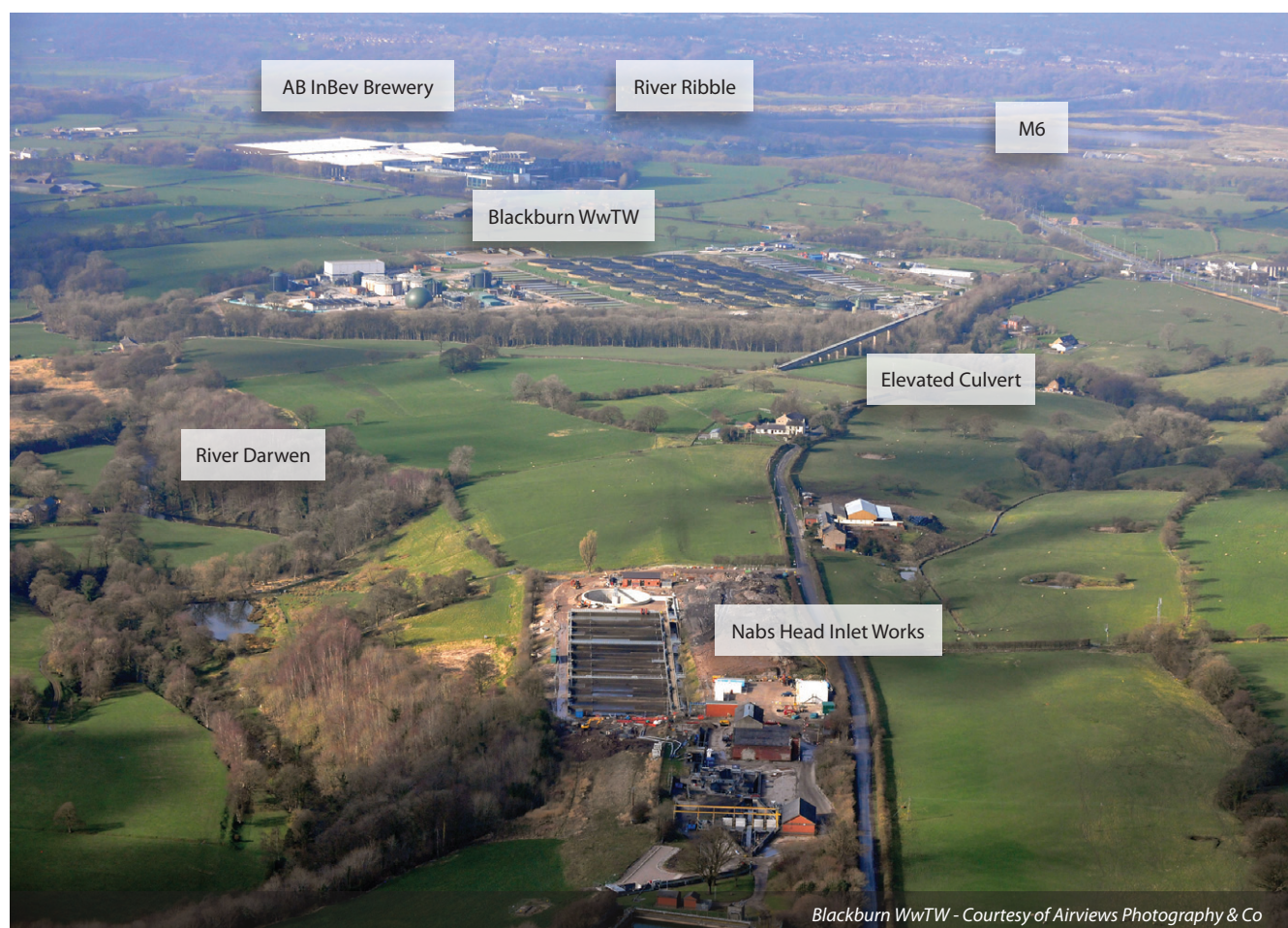
Blackburn WwTW

A review of the existing proposal identified some omissions and technical challenges. One area in particular was the route of the 6.8km rising main. This had to gain about 100m elevation before