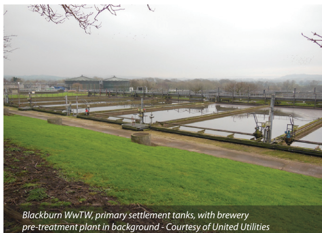
Blackburn WwTW, primary settlement tanks, with brewery pre-treatment plant in background