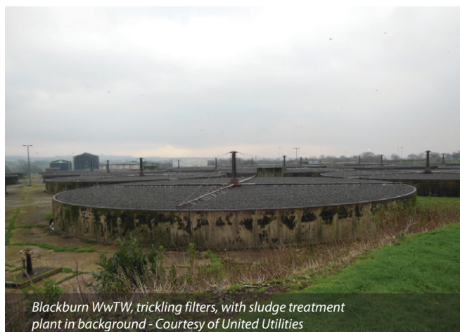
Blackburn WwTW, trickling filters, with sludge treatment plant in background

crossing a motorway, canal, railway, river and a SSSI. A review undertaken by the project team identified an alternative and shorter route of 1.6km by utilising a sewer that was partially installed when Darwen WwTW was potentially being closed as part of the M65 construction in 1981. This brought the additional benefit that it enabled both FTFT and all storm returns to be passed into the Blackburn catchment under gravity. This would significantly reduce both construction and operational costs.