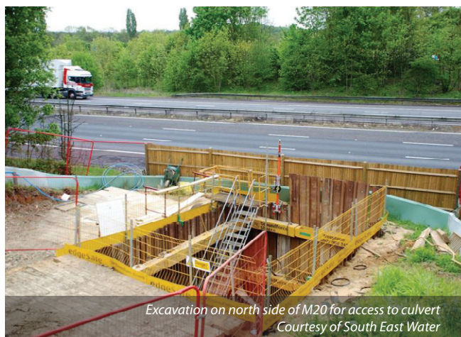
Excavation on north side of M20 for access to culvert