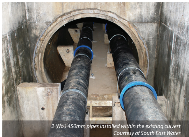
2 (No.) 450mm pipes installed within the existing culvert