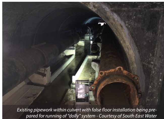
Existing pipework within culvert with false floor installation being prepared for running of "dolly" system

The main advantage of using PE through the tunnel would be a faster installation method, as the pipework could be butt-fused outside of the tunnel and then pulled through. In total, it would have reduced the programme by four weeks compared to using a DI solution. However, as the pipework would be unsupported, pipework would expand and contract over a longer period, thus creating enormous pressures and ultimately causing the pipework to fracture/fail. Furthermore, the entire pipeline would need to be changed to barrier pipework to overcome potential hydrocarbon contamination. For these reasons, a DI solution was utilised.