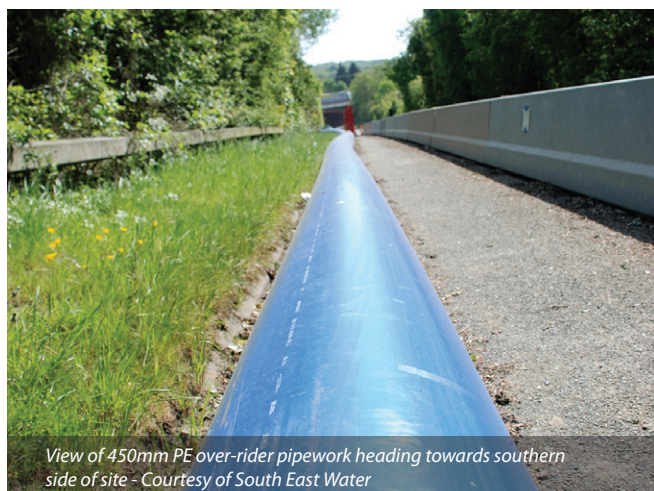
View of 450mm PE over-rider pipework heading towards southern side of site