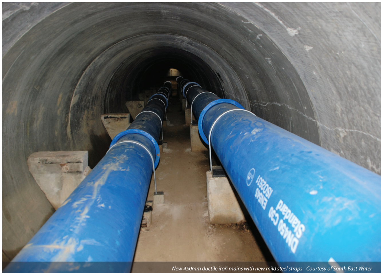
New 450mm ductile iron mains with new mild steel straps