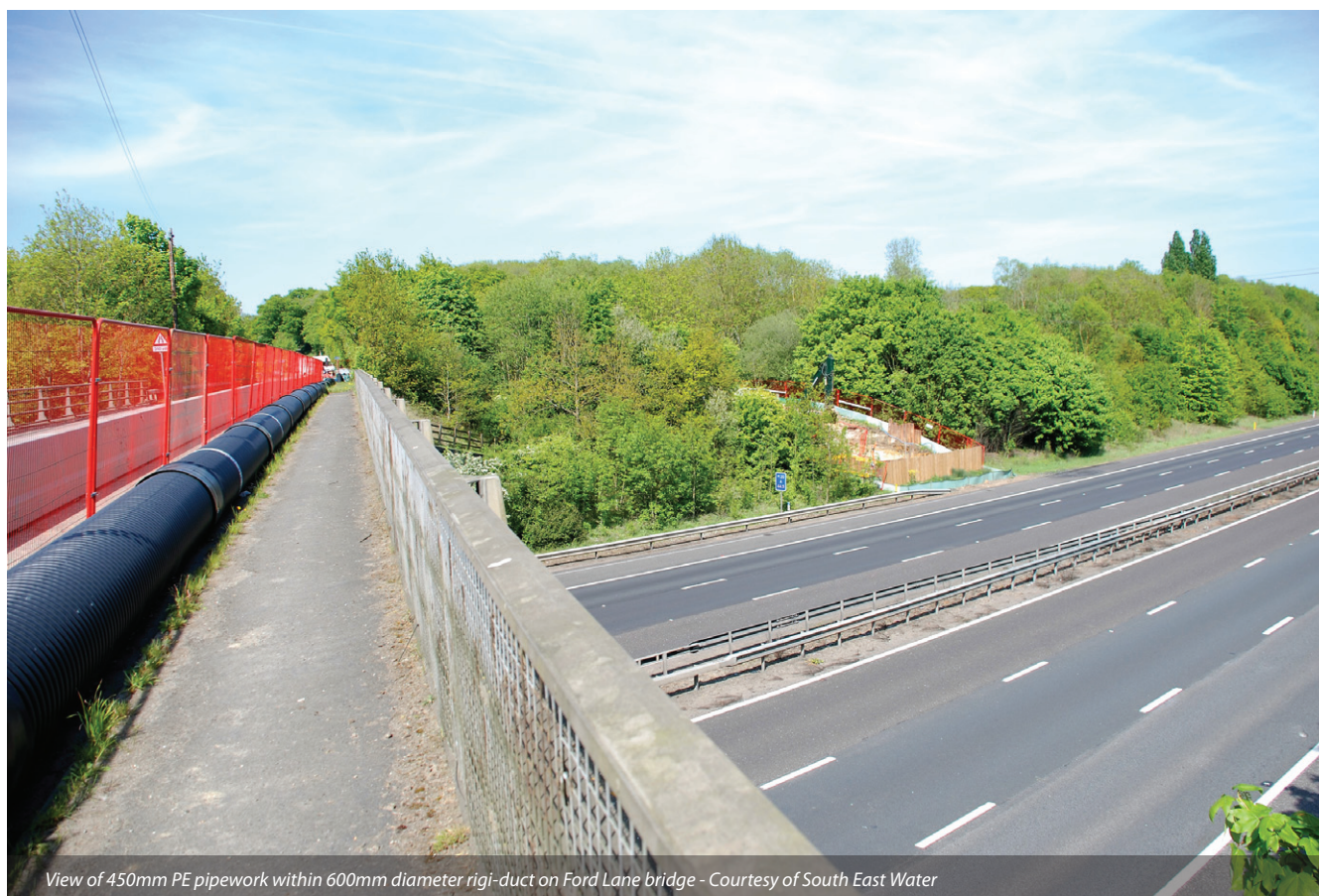
View of 450mm PE pipework within 600mm diameter rigi-duct on Ford Lane bridge

In recent years there have been a number of complex bursts at the edge of the M20 motorway in Kent, where three trunk mains cross via an existing tunnel. The bursts have compromised the security of supply between South East Water's (SEW) Trosley Pumping Station and Beech Reservoir and also flooded onto the hard shoulder of the M20 motorway. The trunk mains in question transfer, at its peak, 17.3 million litres of water to customers in West Malling, Paddock Wood and the surrounding villages. The security of these mains is therefore paramount. Pre-investigation works within the tunnel, which examined the condition of the structure and remaining design life of the existing mains, concluded that they needed replacing.