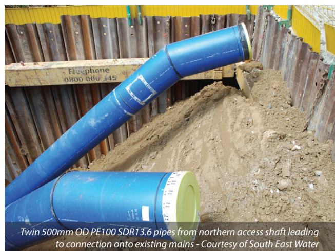
Twin 500mm OD PE100 SDR13.6 pipes from northern access shaft leading to connection onto existing mains

The existing straps were also removed and replaced by new mild steel straps which were then anchored to the floor of the tunnel rather than the concrete support plinths.