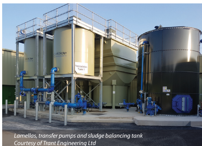
Lamellas, transfer pumps and sludge balancing tank