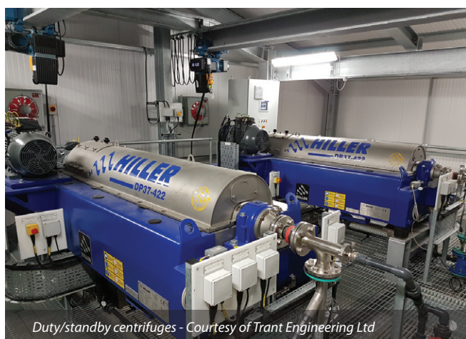
Duty/standby centrifuges