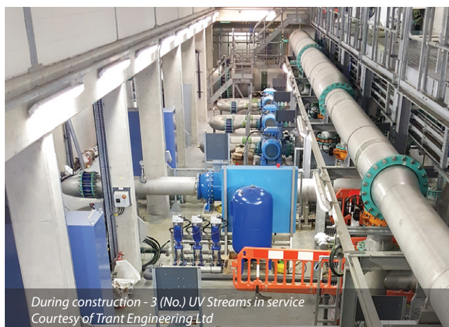
During construction - 3 (No.) UV Streams in service