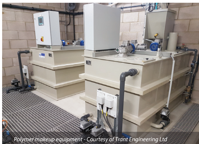
Polymer makeup equipment

inline axial mixed flow booster pump, manual and actuated valves together with the associated 316 stainless steel pipework. Each stream also has a dedicated UV local control panel and UPS.