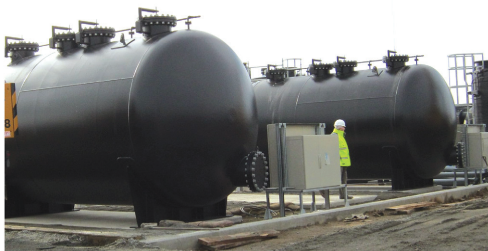
GAC & Pressure Filter Vessels used in Guernsey Airport Water Treatment Facility Project DESIGNED & MANUFACTURED BY PRESSVESS