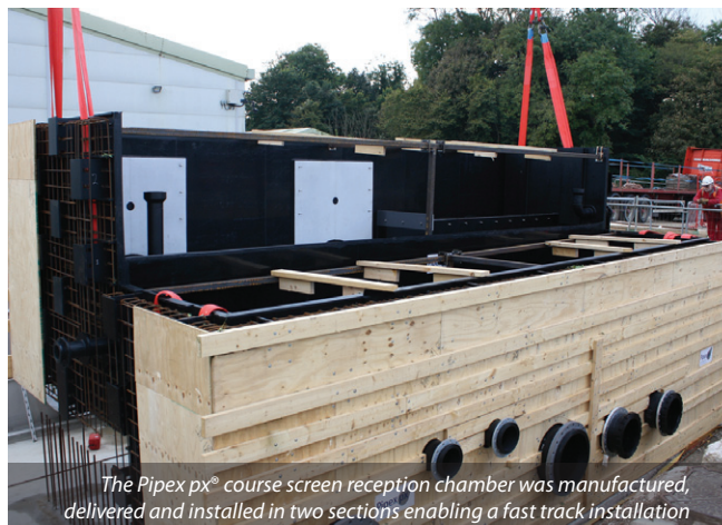
The Pipex px® course screen reception chamber was manufactured, delivered and installed in two sections enabling a fast track installation