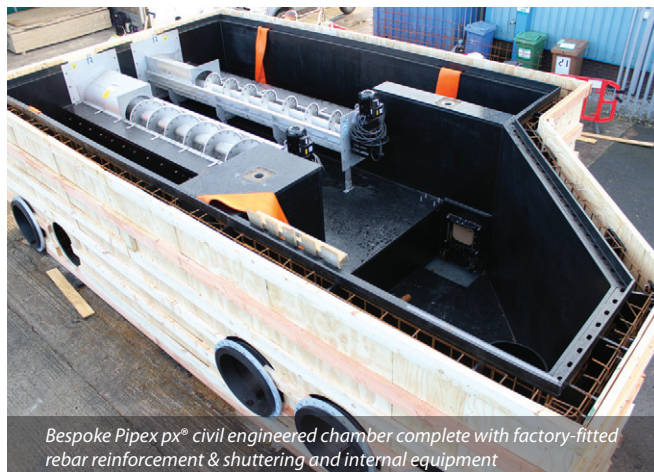
Bespoke Pipex px® civil engineered chamber complete with factory-fitted rebar reinforcement & shuttering and internal equipment