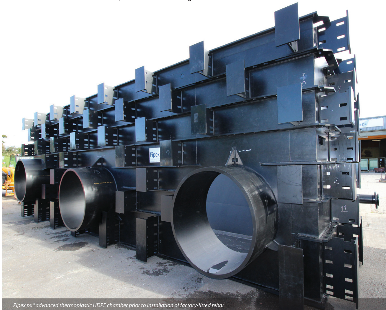
Pipex px® advanced thermoplastic HDPE chamber prior to installation of factory-fitted rebar

In 1989, the UK water industry was privatised, resulting in water companies inheriting reservoirs, treatment works, water mains and sewers which were often outdated and had been outgrown by the increase in population. Since then, investment has been heavily placed in modernising the UK's water and wastewater services, bringing them in line with strict environmental standards and other UK regulations. An increase in population is not the only challenge for the water companies - routine maintenance of its assets is an on-going battle. Traditionally, the structures and pipework at wastewater treatment works (WwTW) are constructed from concrete - the most used man-made material in the world due to its strength and versatility. However unfortunately, over time concrete cannot compete with the harsh and corrosive substances that it faces within a WwTW. Degradation to structures and pipework within a WwTW can result in on-going and costly maintenance for water companies. Design for Manufacture & Assembly (DfMA) solutions are rapidly becoming the preferred way forward to replace or maintain vital assets at a fraction of the time, and in turn reducing short term and life time costs.