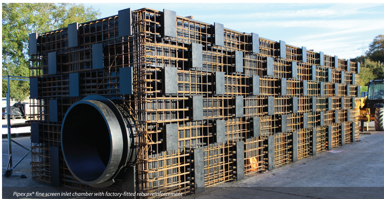
Pipex px® fine screen inlet chamber with factory-fitted rebar reinforcement

Pipex px® bespoke thermoplastic chambers have a 60-year design life dependant on application. The chambers are manufactured to BS EN12573 in reinforced, self-cleansing, hygienic HDPE materials with a smooth internal bore, minimising the risk of leaks, blockages and fats, oils & greases (FOG) accumulation and maintaining flow rates - providing a sustainable and corrosion resistant solution.