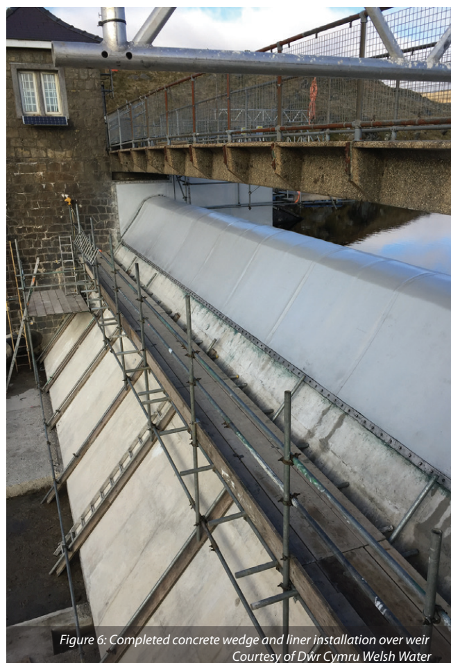
Figure 6: Completed concrete wedge and liner installation over weir