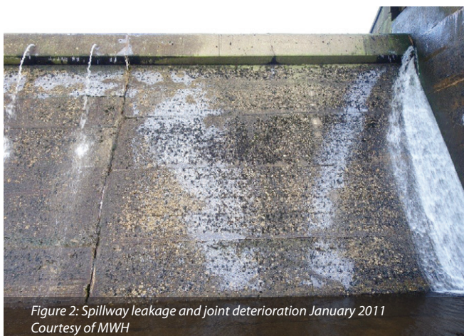
Figure 2: Spillway leakage and joint deterioration January 2011