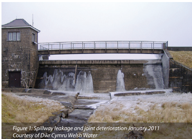
Figure 1: Spillway leakage and joint deterioration January 2011