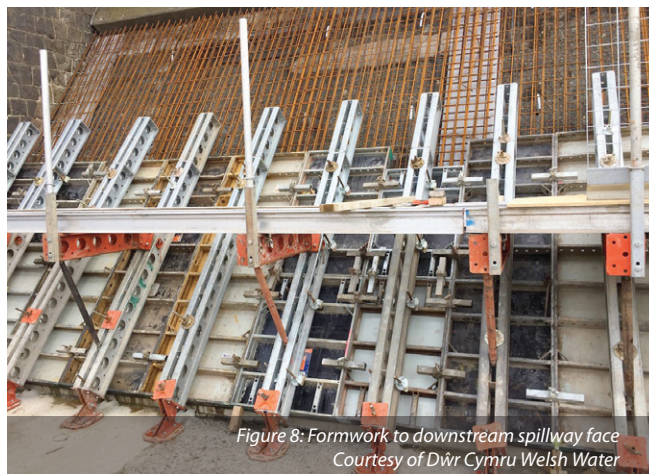
Figure 8: Formwork to downstream spillway face

The editor and publishers would like to thank MWH now part of Stantec, and Dŵr Cymru Welsh Water, for providing the above article for publication