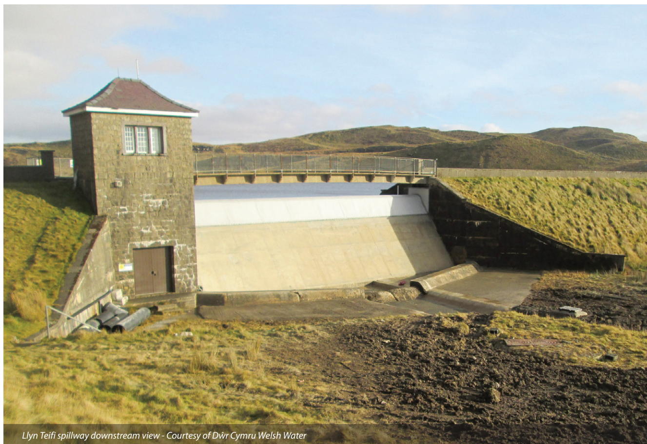
Llyn Teifi spillway downstream view - Courtesy of Dŵr Cymru Welsh Water

Llyn Teifi Reservoir is situated in a remote area on the western slopes of the Cambrian Mountains in Ceredigion, west Wales, and was created in the early 1960s by raising a natural lake. It is impounded behind six embankments constructed across natural low spots along its south-western margin, covering an area of just over 25 hectares and with a capacity at top water level of around 848,000m 3 . The main embankment is an earth embankment with a central concrete core, 160 m long and with a maximum height of 5m. It includes the main overflow and spillway.