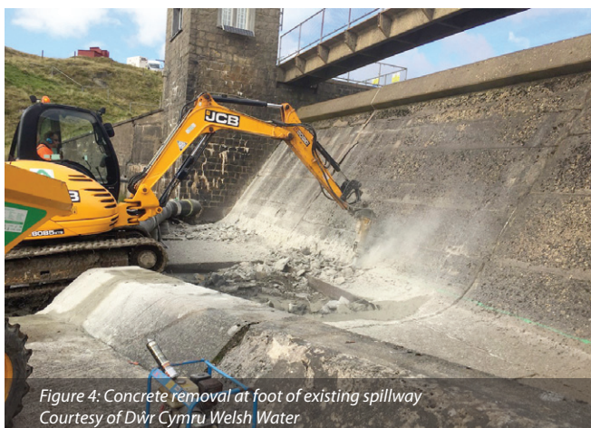
Figure 4: Concrete removal at foot of existing spillway

situation over the years. In 1984, the reservoir had been drained to allow refurbishment of both the upstream and downstream joint faces. However, by 2004, when Black & Veatch carried out an inspection, it was reported that ‘when water levels are high, the top two horizontal construction joints (about 400mm and 700mm below the underside of the recent crest raising structure) each show evidence of a direct seepage path, with spouts of water emerging during heavy wave action. Even with the water level 1.15m down during this inspection there was evidence of seepage from both of these joints’ .