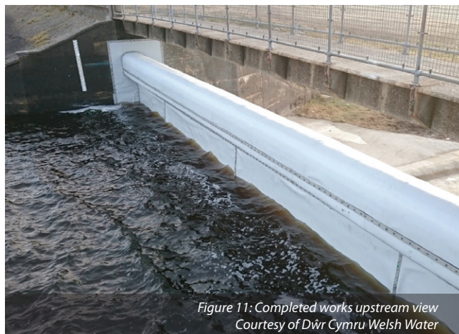
Figure 11: Completed works upstream view