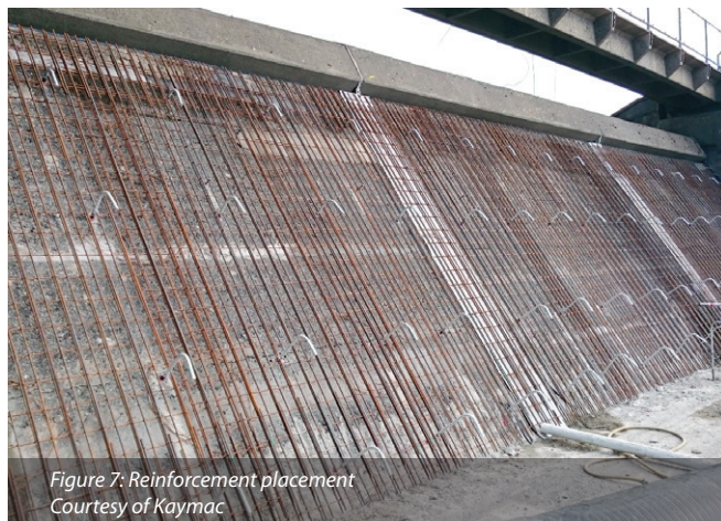
Figure 7: Reinforcement placement