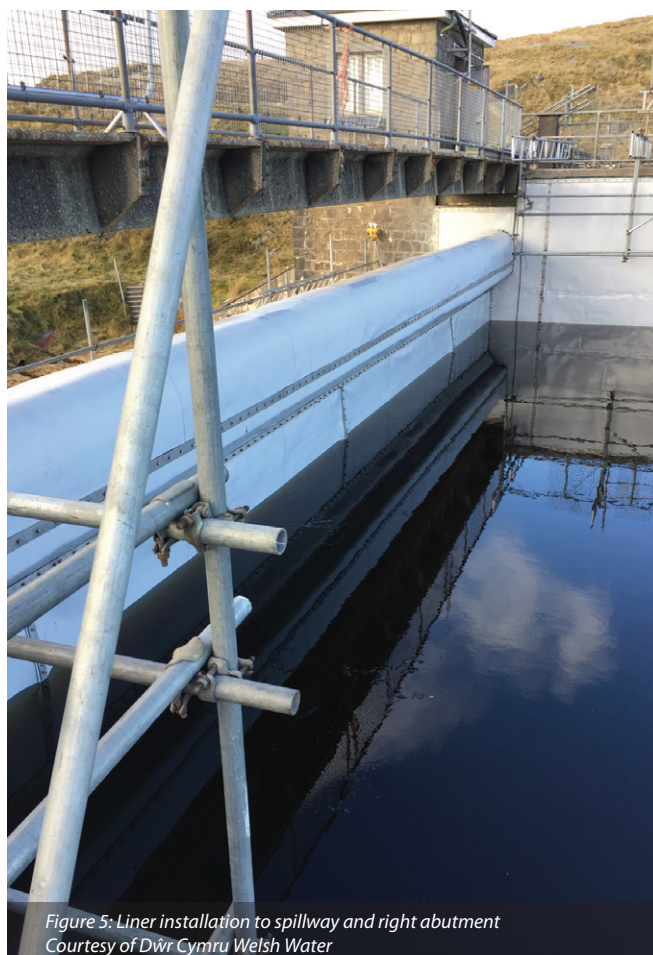
Figure 5: Liner installation to spillway and right abutment

Geocomposite membrane: The system proposed by Carpi Tech for the upstream face of the concrete overflow section comprised a