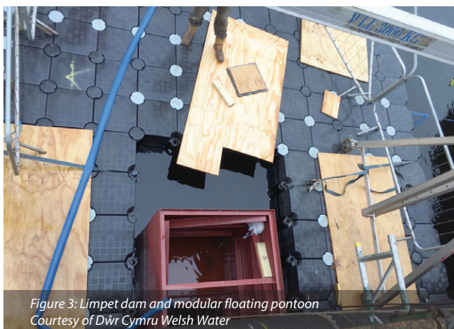
Figure 3: Limpet dam and modular floating pontoon