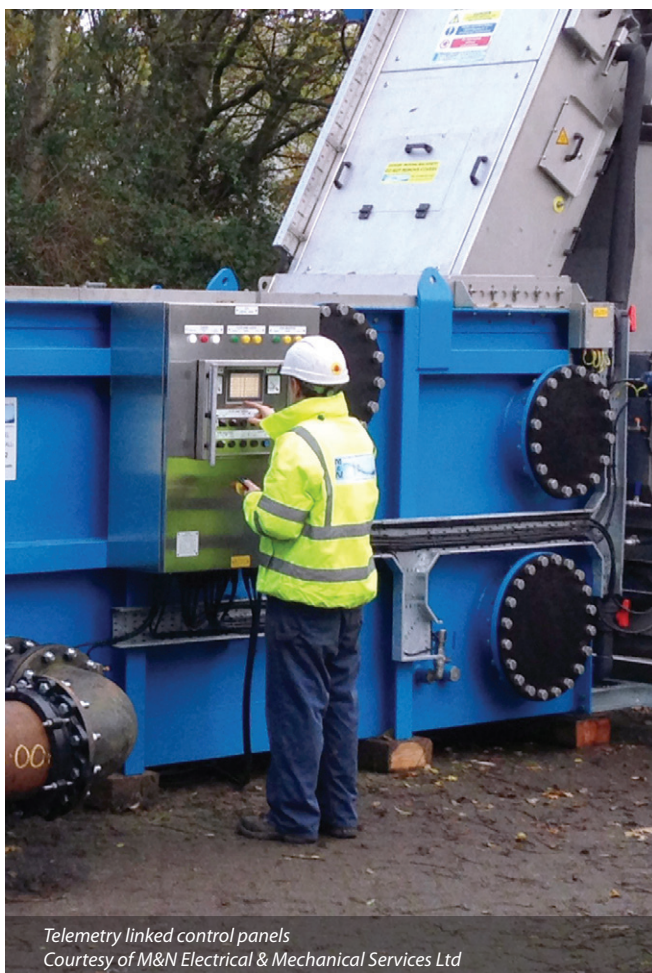
Telemetry linked control panels

M&N's dedicated SRP packaged plant units were designed and manufactured in-house to provide a flexible wastewater screening solution that can be rapidly deployed to site, providing operational stability, with minimal disruption to site infrastructure.