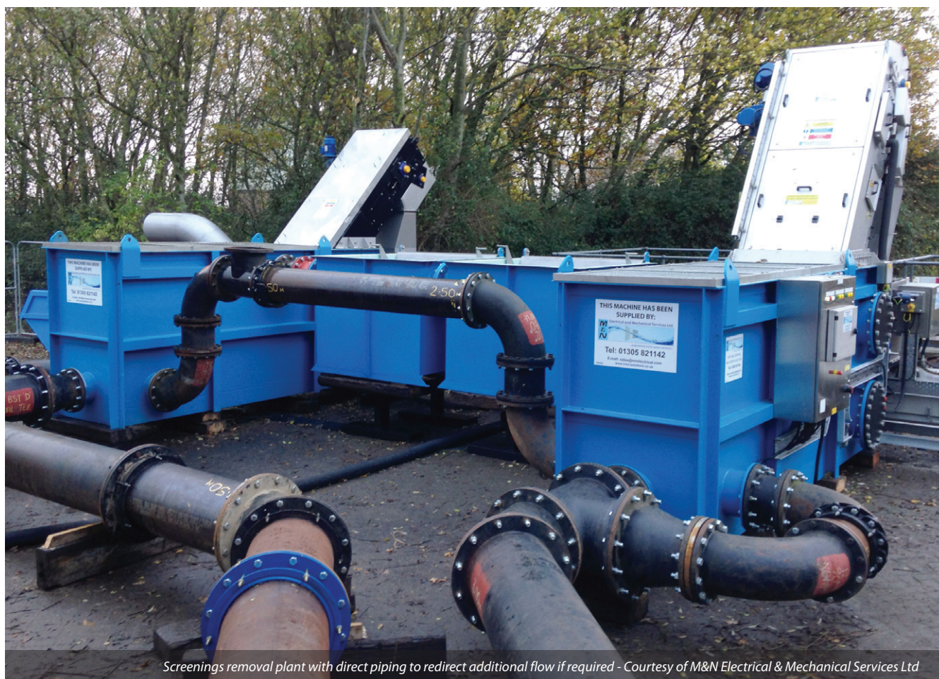
Screenings removal plant with direct piping to redirect additional flow if required

Situated 2 miles from the coastal town of Portishead on the Severn Estuary, Portbury Wharf STW was granted its first consent to operate in 1987. The site underwent a refurbishment in late 2015 and currently services Portishead and the surrounding area, equating to a population in the region of 32,000. Portbury Wharf is comfortably equipped to handle flow rates of 550l/s and treats wastewater flows from five pumping stations located in Clapton-In-Gordano, Portishead, Portbury Dock and Portbury Drove. Historically a heavily industrialised area, Portishead now acts as a dormitory town for Bristol and the surrounding area and features a stunning residential marina development where power and chemical plants had previously dominated the landscape.