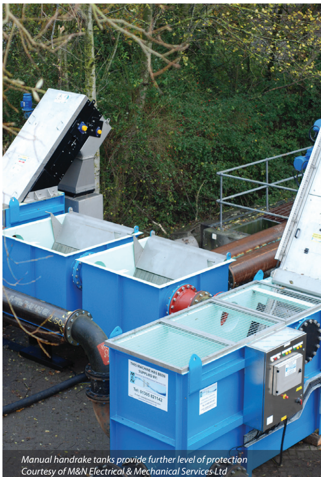
Manual handrake tanks provide further level of protection