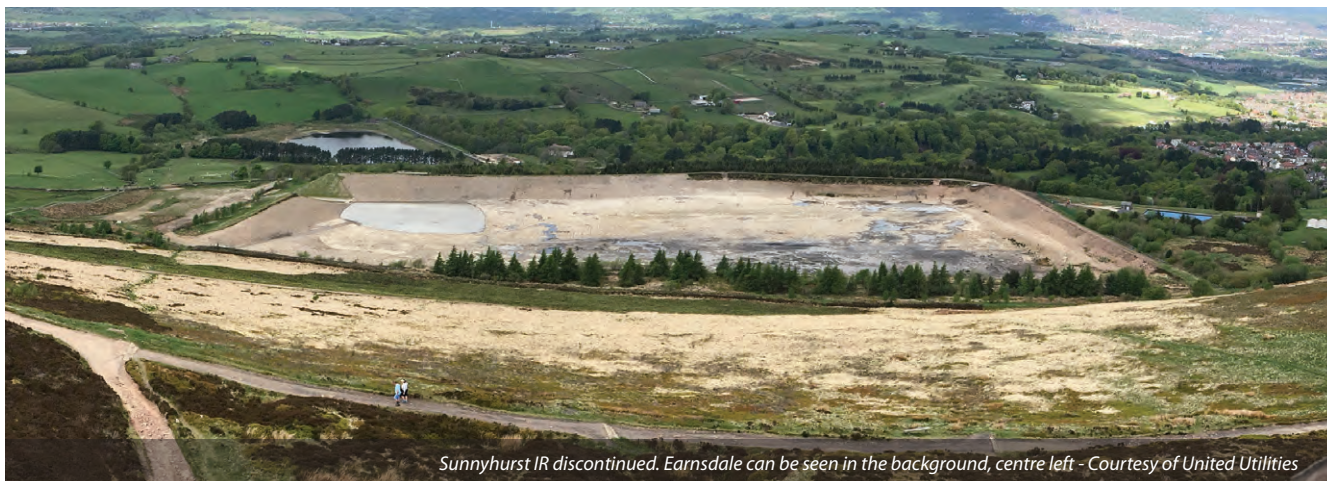
Sunnyhurst IR discontinued. Earnsdale can be seen in the background, centre left

The basin was very flat and needed to be reprofiled so it gently rose away from the notch, reducing the volume retained by the weir whilst providing temporary storage, which drains through the retaining structure (with low level orifice and high level weir) into the transfer pipeline. The final solution included a low level wet land area upstream of the retaining structure to act as a silt trap and increase biodiversity potential within the basin.