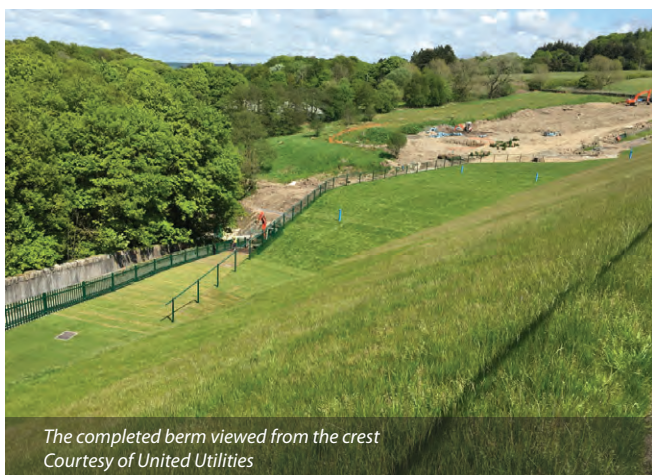
The completed berm viewed from the crest