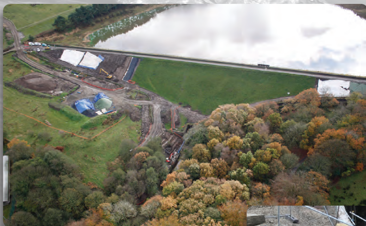
Earnsdale during the installation of the filter and drainage layers

Erosion along the outside of the scour pipe was also assessed as an intolerable failure mechanism. As such a filter and drainage layer was also placed around the scour pipe at the toe of the embankment. This included a separate v notch flow measurement chamber.