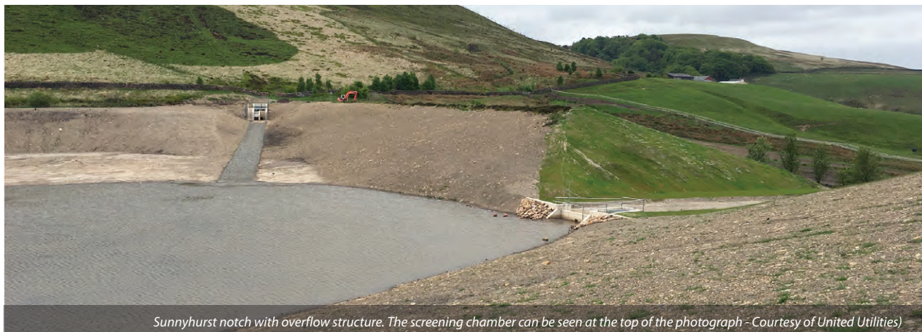
Sunnyhurst notch with overflow structure. The screening chamber can be seen at the top of the photograph