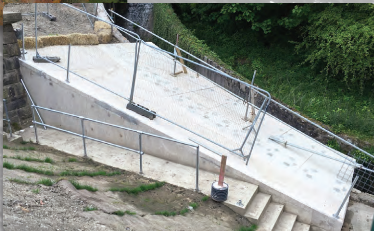
Flow deflector and toe weight