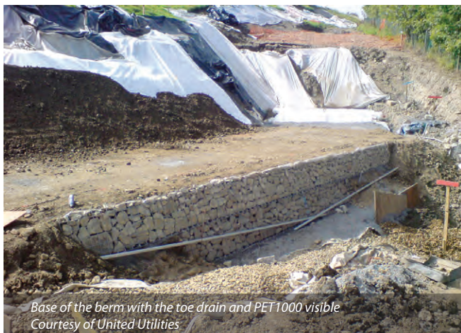
Base of the berm with the toe drain and PET1000 visible