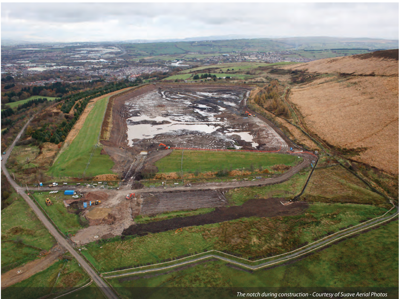
The notch during construction

Sunnyhurst and Earnsdale Impounding Reservoirs (IR) are situated 1.5km to the west of Darwen town centre in Lancashire and are owned and operated by United Utilities. Sunnyhurst IR is one of the raw water sources of Fishmoor WTW, which feeds Blackburn and the surrounding areas (population equivalent of 100,000 people). Earnsdale IR provides compensation water to Sunnyhurst Brook. The purpose of this project is to reduce the probability of embankment failure at both reservoirs. At Earnsdale IR the probability of failure has been reduced by constructing a toe berm and filter, thus improving the stability of the embankment and providing a mechanism to control seepage and thereby preventing internal erosion. At Sunnyhurst IR the probability of failure has been removed through discontinuance of the reservoir by notching the embankment, thereby reducing its ability to hold water other than in relation to a prescribed flood condition.