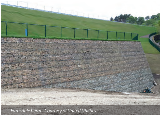
Earnsdale berm - Courtesy of United Utilities