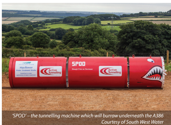
'SPOD' – the tunnelling machine which will burrow underneath the A386