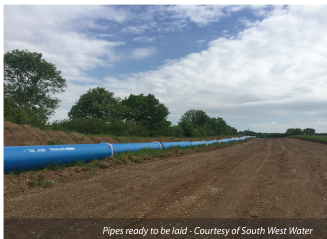
Pipes ready to be laid