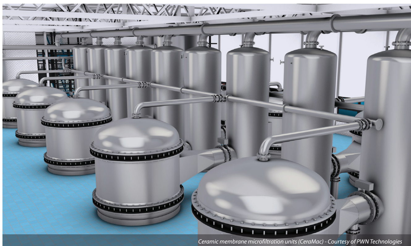
Ceramic membrane microfiltration units (CeraMac)

South West Water (SWW) has started construction on a new £60m state-of-the-art water treatment works in Devon, the company's flagship project in its 2015-2020 business plan. Mayflower WTW will use cutting-edge treatment processes, designed and developed by leading Dutch water technology company PWN Technologies and will serve around 250,000 customers in Plymouth and the surrounding area. It is being built at Roborough Down, just outside the city, and will replace Plymouth's outdated Crownhill WTW. The construction phase is scheduled to finish by the end of March 2018. Mayflower WTW will become operational in September 2018, with Crownhill WTW retiring from service a few months later. The new works will be capable of producing up to 90ML of drinking water every day, with an average of 55ML a day. It will serve more than 6,000 businesses, including Her Majesty's Naval Base Devonport and Derriford Hospital.