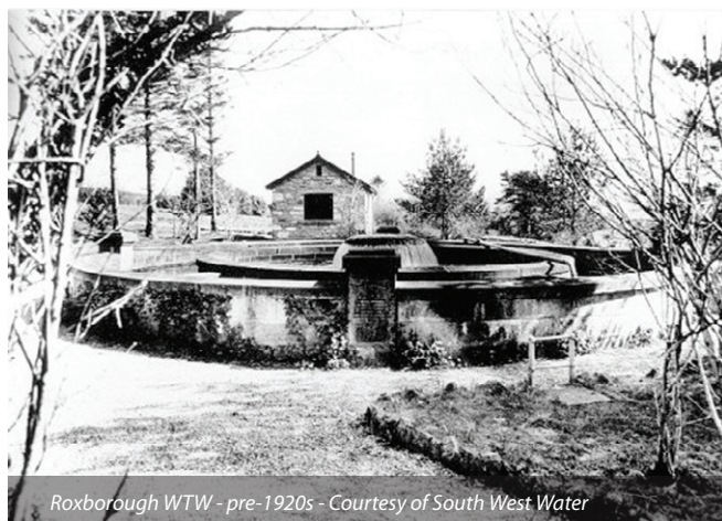
Roxborough WTW - pre-1920s - Courtesy of South West Water