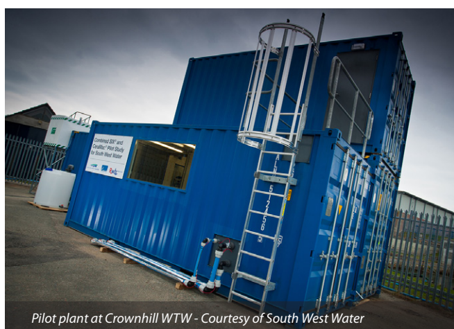
Pilot plant at Crownhill WTW