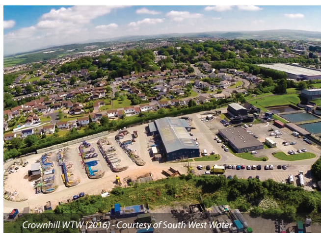
Crownhill WTW (2016)