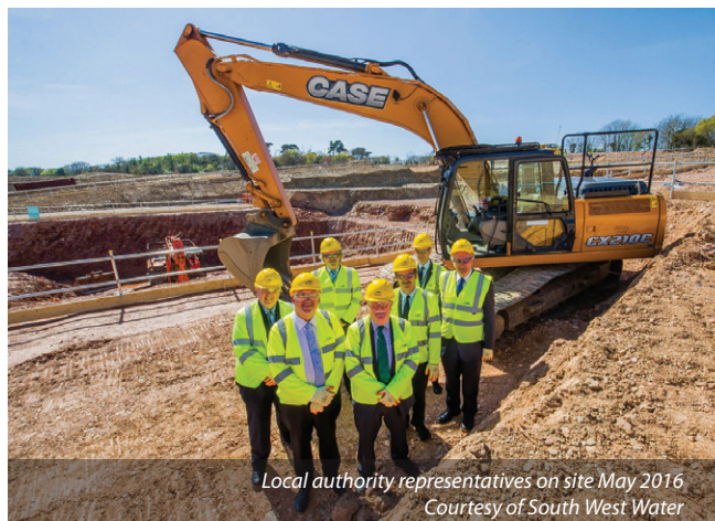
Local authority representatives on site May 2016