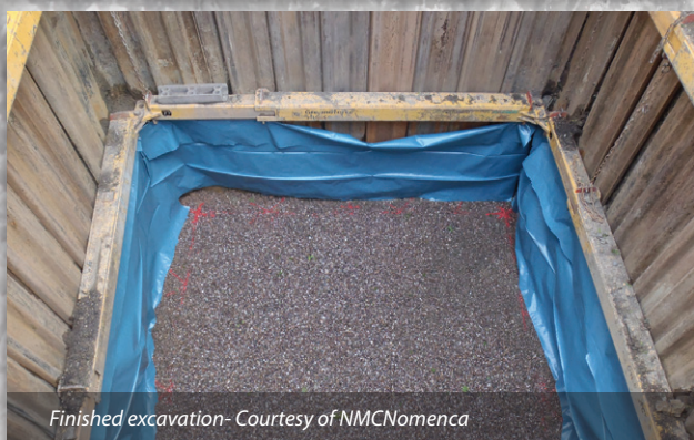
Finished excavation