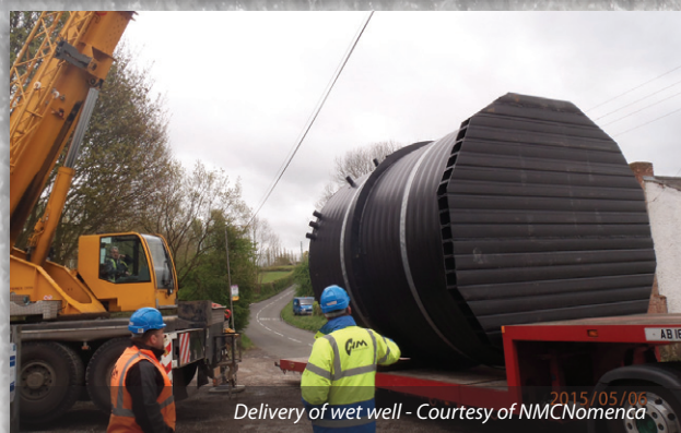
Delivery of wet well