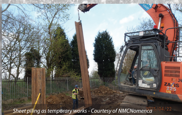
Sheet piling as temporary works

Severn Trent Water's (STW) Sotshole Sewage Pumping Station is situated between the village of Heage and the town of Belper, Derbyshire. The existing pumping station serves approximately 330 individuals from the surrounding residential area and is comprised of a wet and dry well topped by a brick superstructure. The emergency overflow chamber is located within the small compound and comprises of a separate storm well with an overflow to the nearby watercourse. The existing pump station offered less than the 2 hours storage at 3 x dry weather flow (as stipulated by Severn Trent Water's standards) and when pump failure occurred, the surcharging system resulted in pollution incidents to the nearby watercourse.