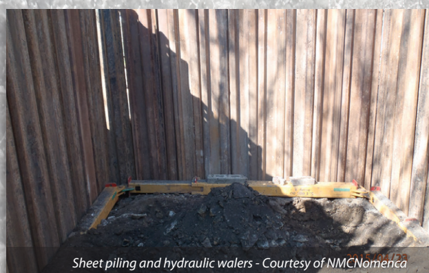
Sheet piling and hydraulic walers