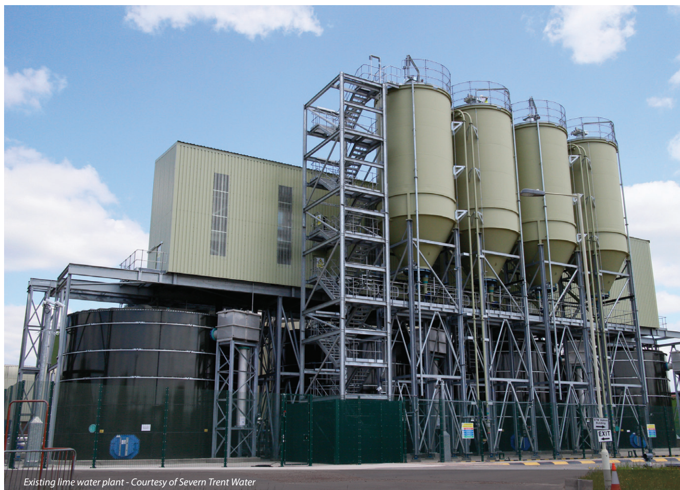
Existing lime water plant