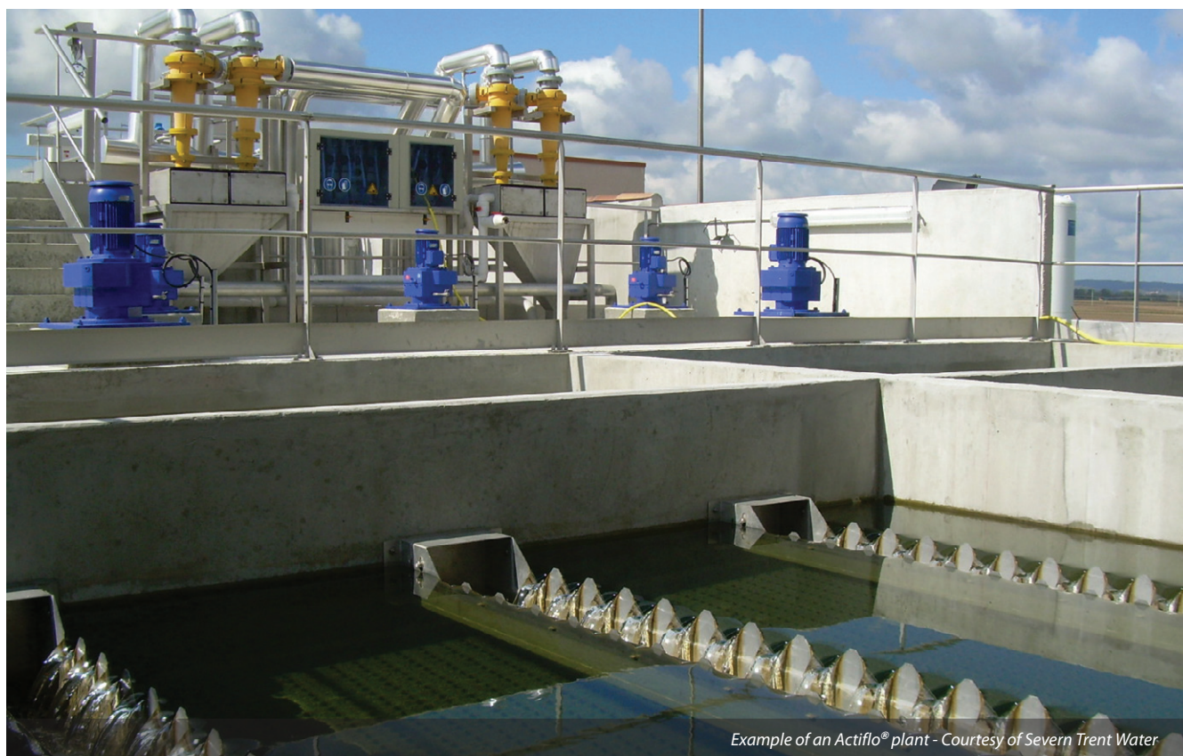
Example of an Actiflo® plant

F rankley water treatment works (WTW) is located to the south west of Birmingham city centre. It is the primary water treatment works supplying potable water to the city of Birmingham. The Elan Valley Aqueduct (EVA) is a 118km gravity aqueduct that conveys raw water from the Elan Reservoirs in mid Wales to Frankley WTW. The Elan Reservoirs are the primary raw water source for Frankley WTW. Additional raw water can be pumped to Frankley WTW from an existing intake on the River Severn located at Trimpey. The treatment processes at Frankley WTW are capable of treating River Severn raw water as a small proportion of the total flow by blending with Elan raw water and pesticides removal using granular activated carbon (GAC) filters.