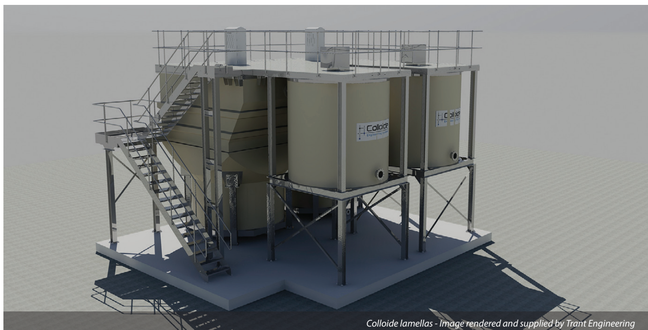
Colloide lamellas