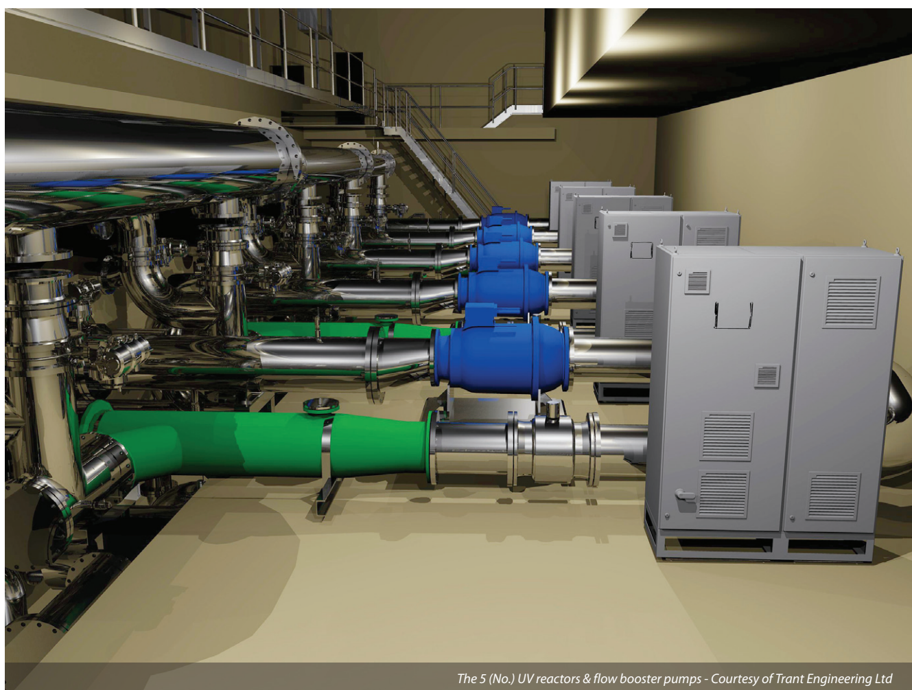
The 5 (No.) UV reactors & flow booster pumps

Portsmouth Water's Farlington WTW dates back to 1909 and provides potable water to more than 280,000 people and many businesses in the Portsmouth and Havant area. Farlington's supply is derived from the springs, which are believed to be the largest spring source in Europe. Raw water is chlorinated at the spring source pumping stations. At Farlington WTW, water gravitates from the inlet splitter chamber to the thirteen rapid gravity filters. When the raw water quality deteriorates, aluminium sulphate is dosed upstream of the rapid gravity filters. Filtered water then gravitates into a common filtered water outlet channel where it is chlorinated. The filtered and chlorinated water then gravitates to the membrane filtration plant before being dosed with phosphoric acid upstream of the contact tank. All wastewater flows from the treatment plant are currently discharged off site.