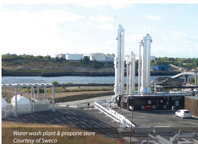
Water wash plant & propane store

Biomethane injection can recover over 95% of the energy content of biogas as a zero carbon fuel. In contrast, the engine-based CHP installation matched to an AAD process at Howdon has an energy efficiency of around 62%.