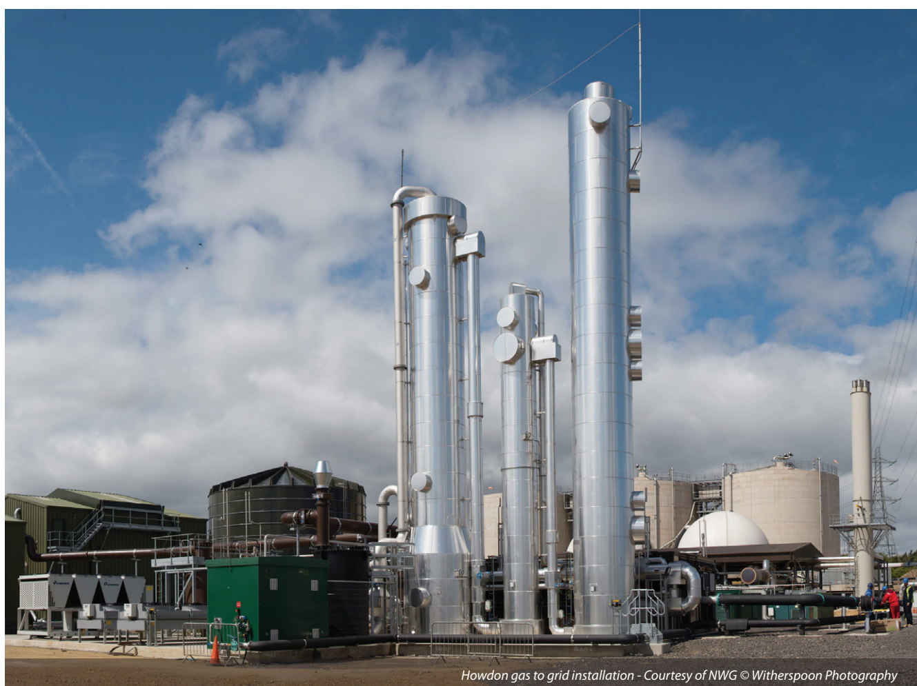
Howdon gas to grid installation

The Northumbrian Water Group (NWG) Howdon site, located on the banks of the River Tyne to the east of Newcastle is the largest sewage treatment works on the eastern coast of England. The plant is capable of treating in excess of 40,000 TDS/annum of indigenous and imported sludge using a Cambi Advanced Anaerobic Digestion (AAD) process commissioned in 2012. Biogas produced in the digestion process is supplied to 3 (No.) MWM gas engines each rated for an electrical output of 2MW. Waste heat from the engine exhaust is recovered and used to assist in generating the steam used in the AAD process.