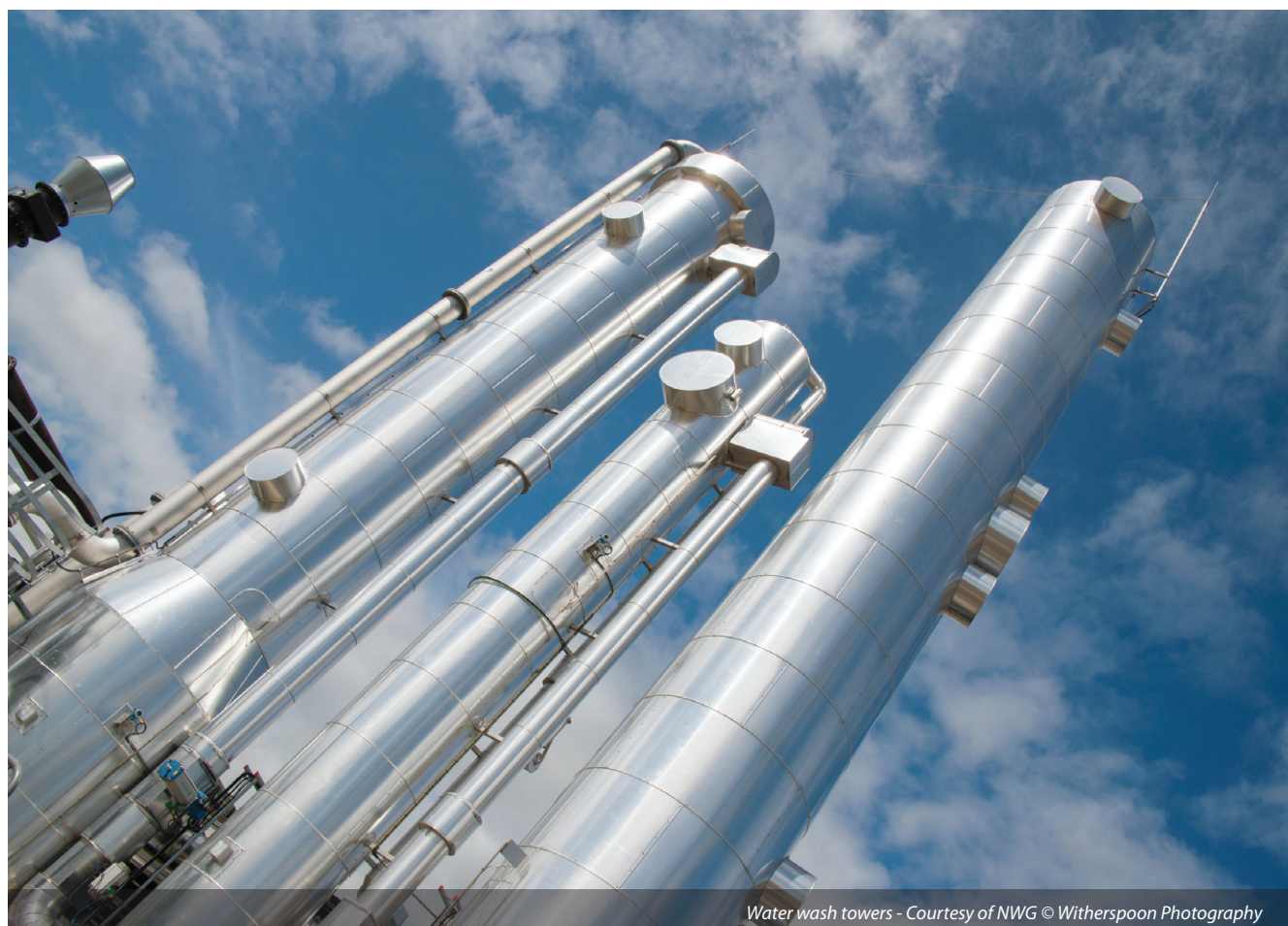
Water wash towers

Grid capacity: The Howdon site is located in a lightly populated area served by an intermediate pressure natural gas distribution system. The demand on this gas supply is mainly residential; consequently there are periods during summer months when demand is lower than the potential output of the biomethane plant. Restrictions on the operation of the plant would have a negative impact on the business case.