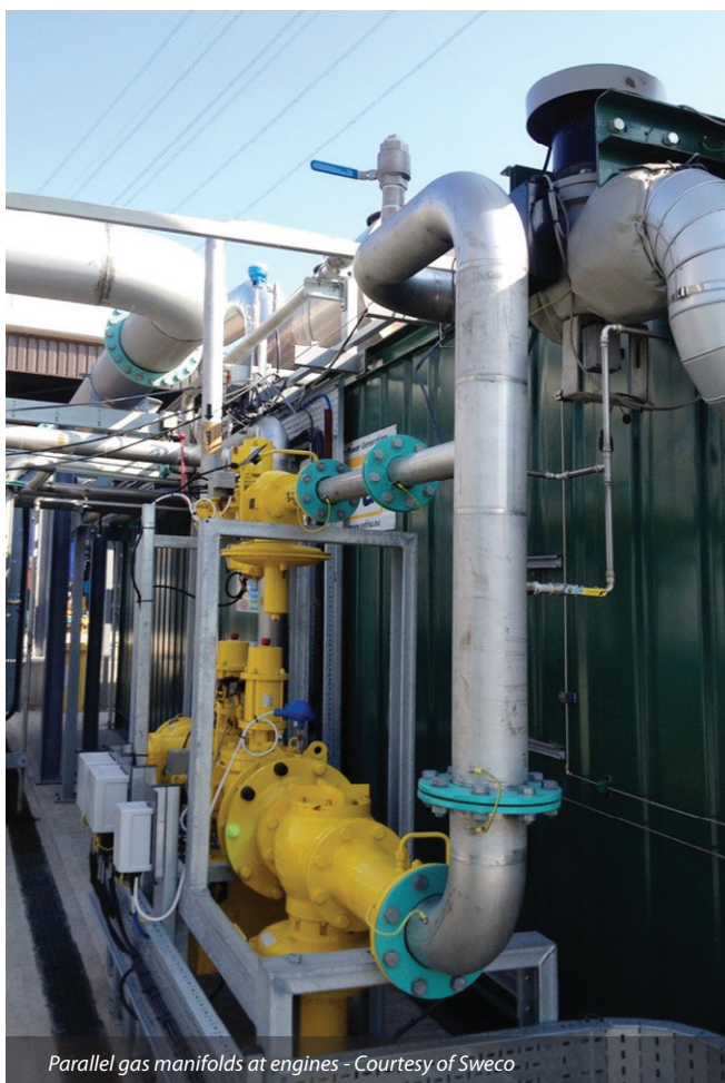
Parallel gas manifolds at engines

Sweco developed financial models to allow evaluation of the impact of this restriction and the returns on the additional capital investment required to mitigate these. Following this evaluation it was decided to convert the three existing engines to allow them to operate on either biogas or natural gas fuel.