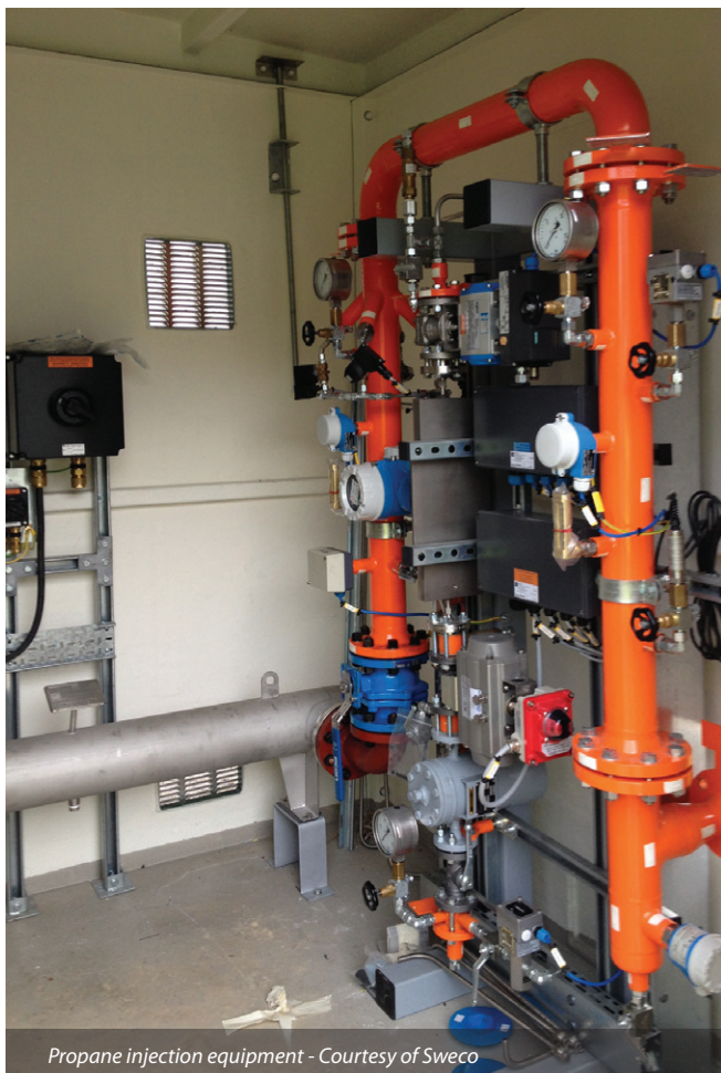
Propane injection equipment