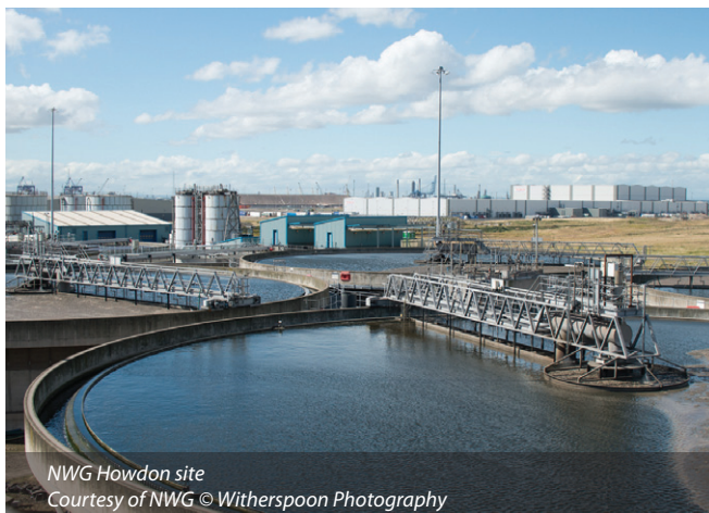
NWG Howdon site