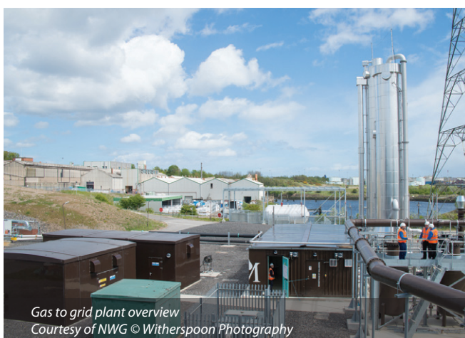
Gas to grid plant overview