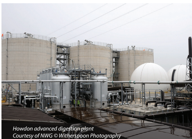
Howdon advanced digestion plant