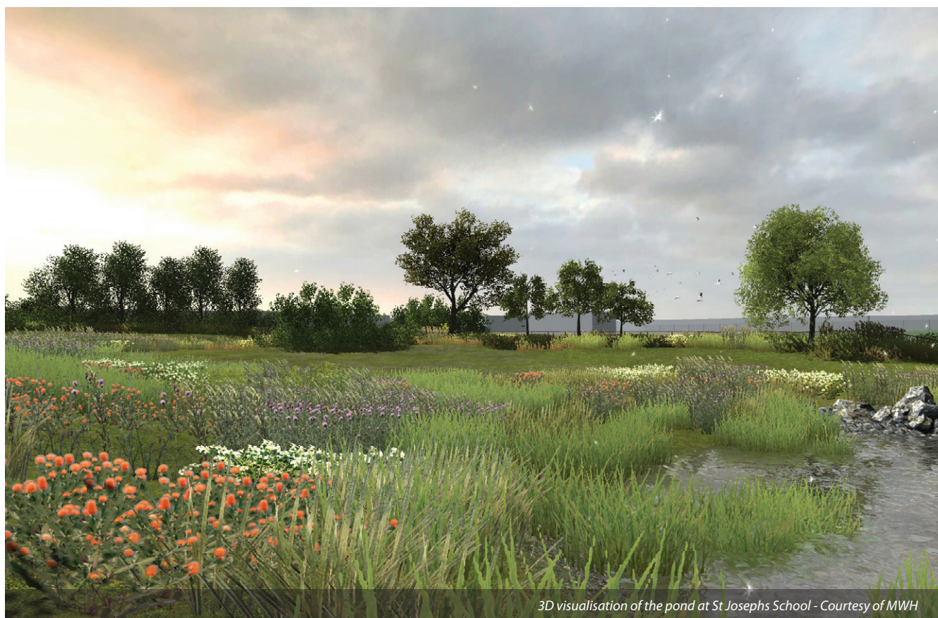
3D visualisation of the pond at St Josephs School - Courtesy of MWH

Fellgate estate in Jarrow, Tyne and Wear has a history of flooding and suffered extensive property flooding in 2012, affecting 175 properties. Flooding originated from sewers, highway drainage, runoff from land, small water courses and ditches during heavy rainfall. Northumbrian Water and the local authority South Tyneside Council share responsibility for surface water management and worked together to find a sustainable solution to flooding. The new solution, designed by MWH, comprised conventional sewer network enhancements, SuDS and exceedance pathways to manage surface water across the catchment. This included swales, bunds and detention basins that blend with the existing environment.