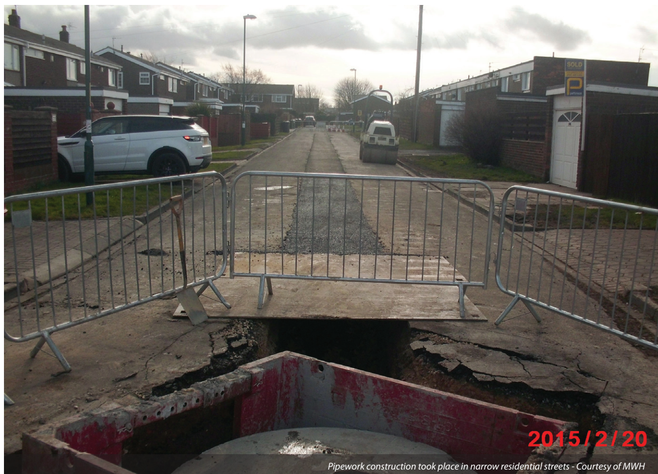
Pipework construction took place in narrow residential streets