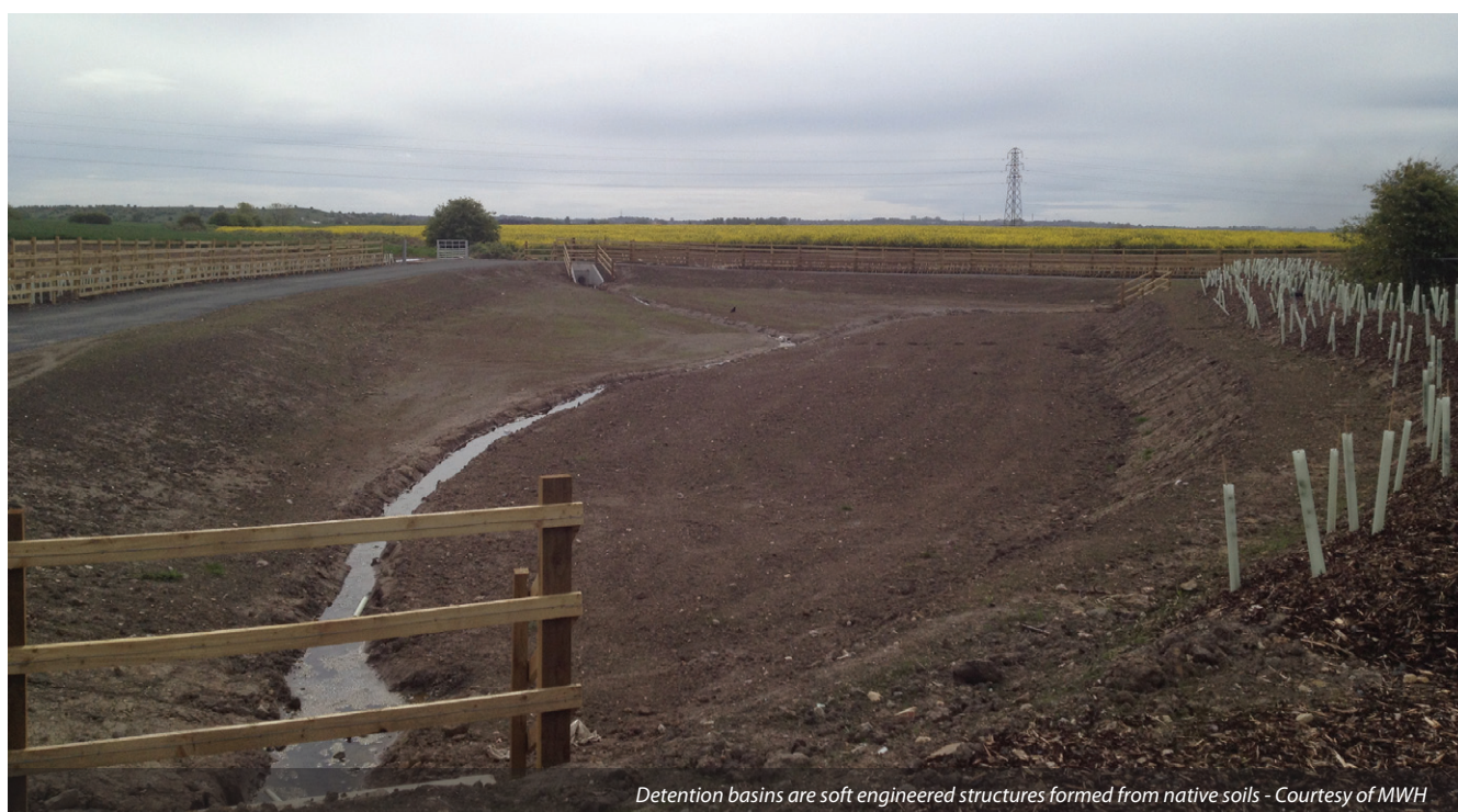
Detention basins are soft engineered structures formed from native soils