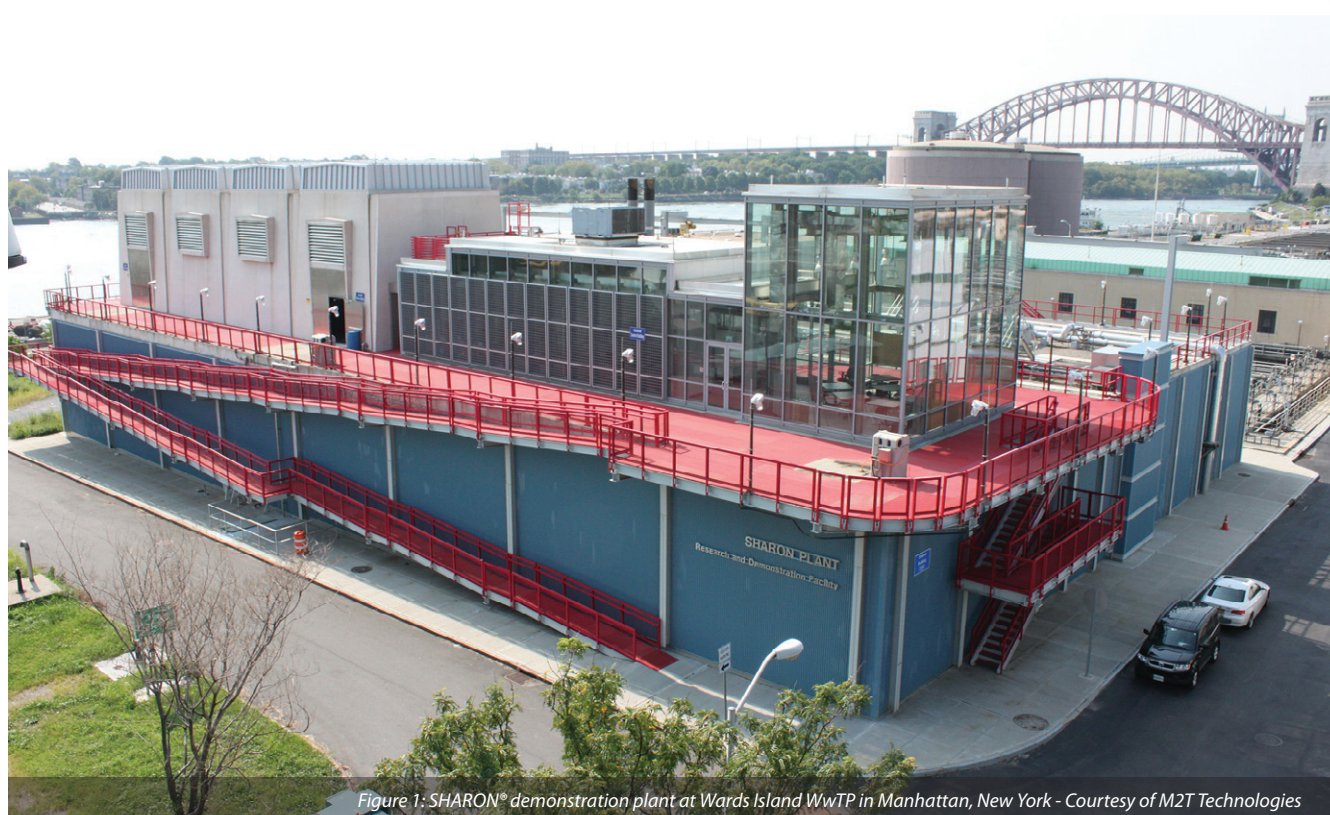
Figure 1: SHARON® demonstration plant at Wards Island WwTP in Manhattan, New York

The concept of sewage treatment plants as 'energy factories' originated in the Netherlands in the early 2000s. The Dutch water boards came together with the express aim of treating wastewater with a significantly reduced energy consumption and to increase energy production, such that their sites could be seen as true 'energy factories'. The energy factory concept has since grown in popularity worldwide thanks to its ability to transform a waste treatment process into a means of generating energy and, now, to recover other bio-resources. Wastewater sludge is no longer seen as a problem, but as a fuel. In the UK the concept is a widespread ambition; e.g. United Utilities stated at the beginning of AMP6 that it had an objective to achieve energy neutrality across its wastewater treatment estate by 2020.