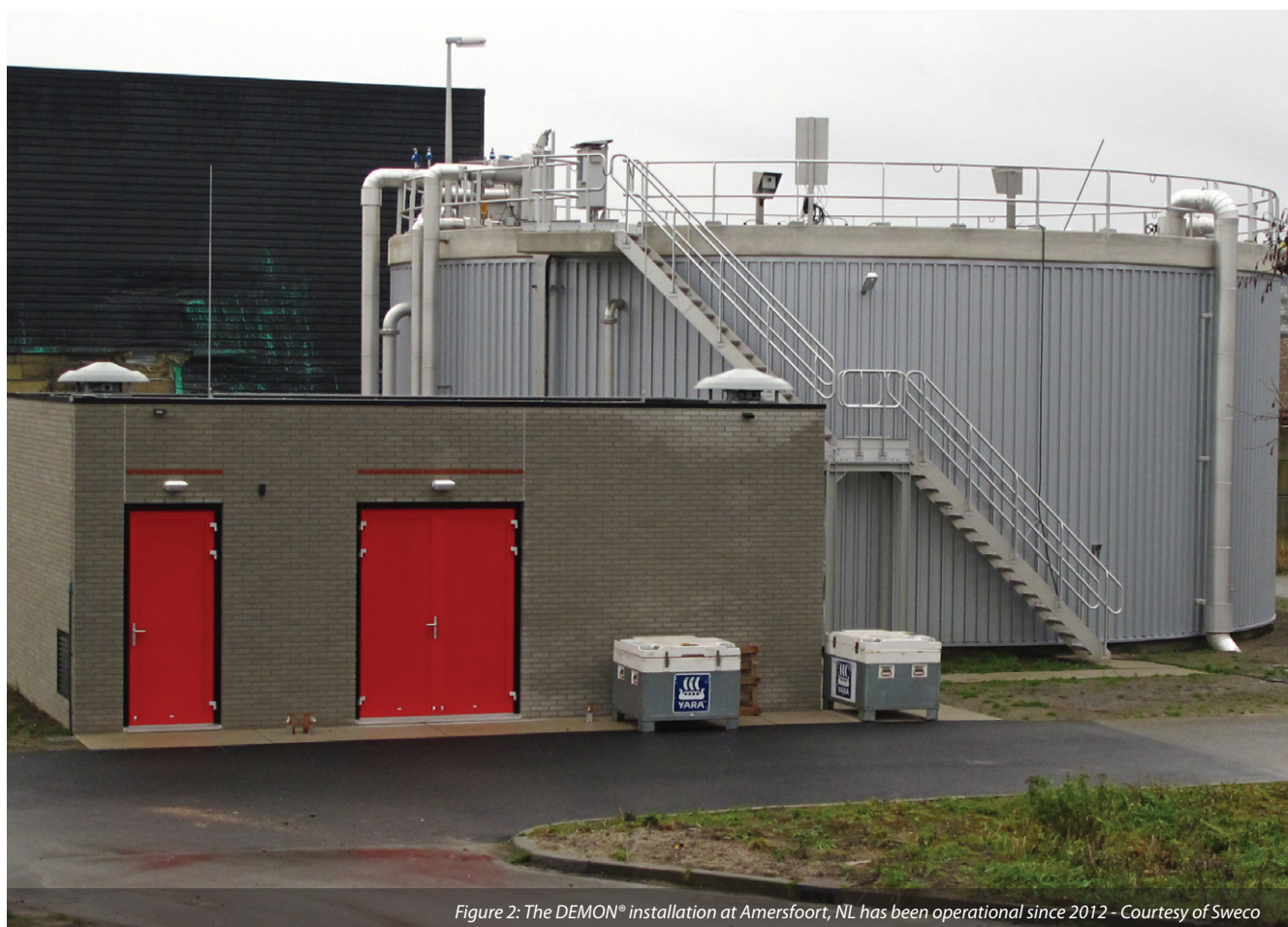
Figure 2: The DEMON® installation at Amersfoort, NL has been operational since 2012

The need for systems such as DEMON® is increasing, particularly for UK wastewater treatment plants. The increased use of thermal hydrolysis processes (THP) in sludge treatment generates increased ammonia loads in the centrate but also introduces a certain level of inhibition, which was thought to limit the effectiveness of many LTP processes.