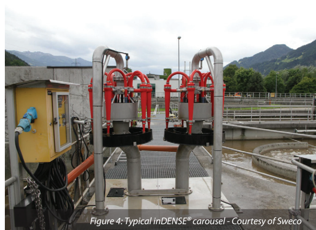
Figure 4: Typical inDENSE® carousel