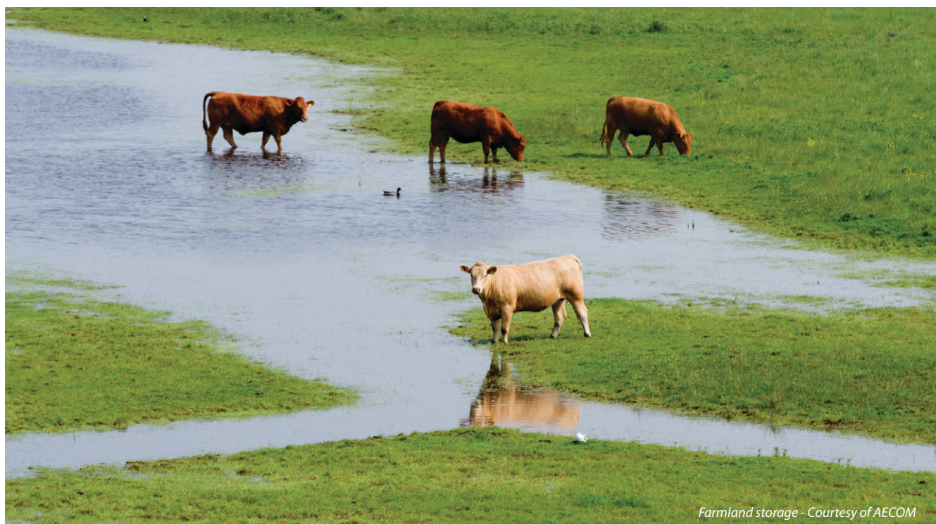
Farmland storage - Courtesy of AECOM

N atural flood risk management (NFRM) is increasingly seen as a valuable addition to conventional flood protection approaches. It is being trialled across several catchments in the UK; however there is currently no spatially integrated approach to assess the relative impact of combined measures across a catchment. An integrated approach to evaluating the flood risk benefits of NFRM has been developed, along with approaches to monitoring, and applied to the River Elwy catchment in North Wales. It is understood that NFRM could complement existing traditional flood defence assets by making the catchment more resilient to climate change. This added resilience allows the engineered works to maintain its standard of protection, e.g. 1 in 100 years, for longer. Incorporating NFRM measures can also provide wider benefits such as improved ecological habitat and water quality, as well as added amenity value. NFRM is part of a catchment-wide approach to flood management that is currently being explored by Natural Resources Wales.