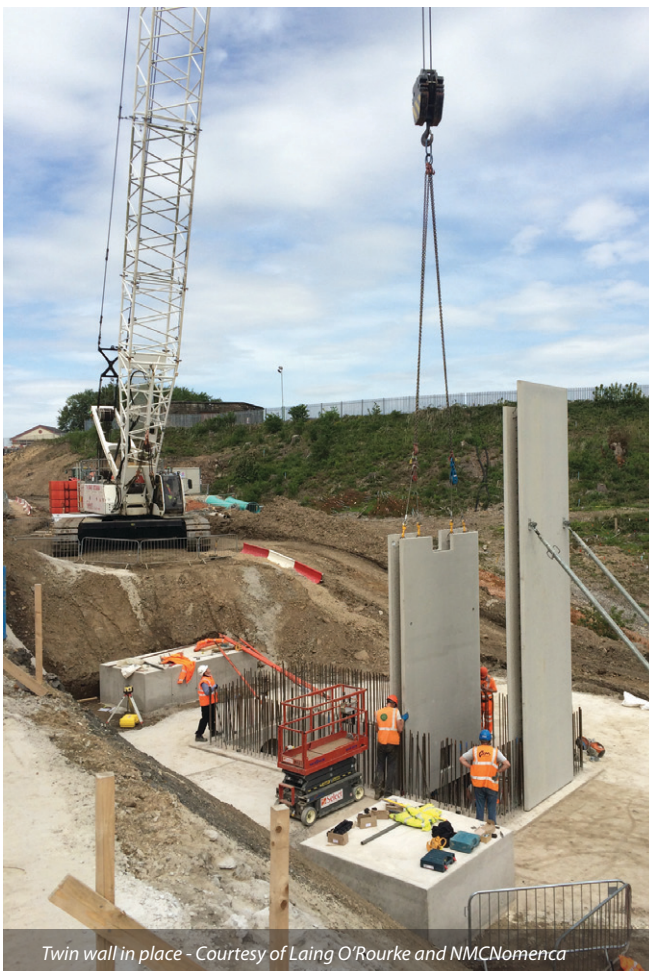
Twin wall in place

positioned to encourage this flow ensuring there are no 'dead spots' in the reservoir. This negated the need to adopt internal walls or curtains to ensure effective flow characteristics within the reservoir.