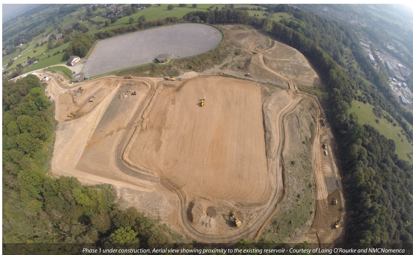
Phase 1 under construction. Aerial view showing proximity to the existing reservoir - Courtesy of Laing O'Rourke and NMCNomenca

A mbergate Service Reservoir at Fritchley has been an essential element of the water supply system to a significant number of customers in Derbyshire, Nottinghamshire and Leicestershire. It was first commissioned over 100 years ago, and although it has provided a reliable service during this time, it is nearing the end of its life in its current condition. The reservoir has exhibited significant cracking in the upper walls and is operated at a lower maximum water level than was originally intended. Similarly, the roof construction comprises a shallow barrel vaulted concrete roof which springs from steel beams which are showing significant signs of deterioration. Severn Trent Water is making this investment to ensure the asset is fit for the next 100 years.