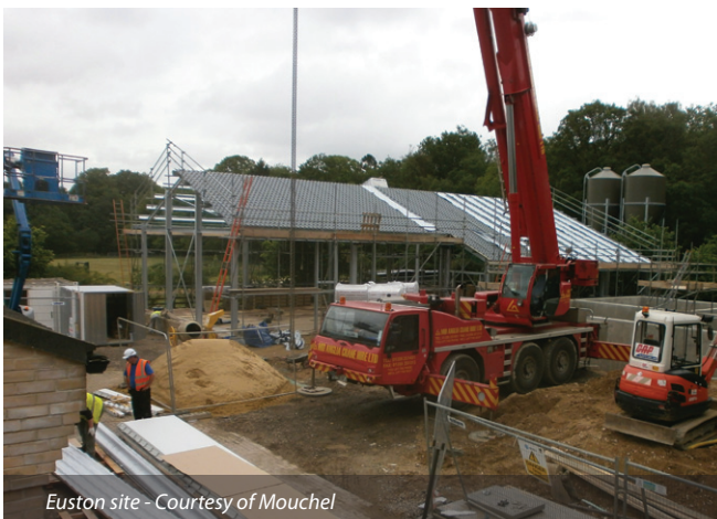
Euston site

to work with organisations like the National Industrial Symbiosis Programme to identify potential non-waste uses for the nitrate removal plant discharge stream. Investigations into groundwater extraction licence trading, new borehole water source construction and catchment management also informed the project and the least whole life cost model.