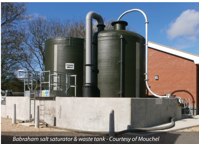
Babraham salt saturator & waste tank