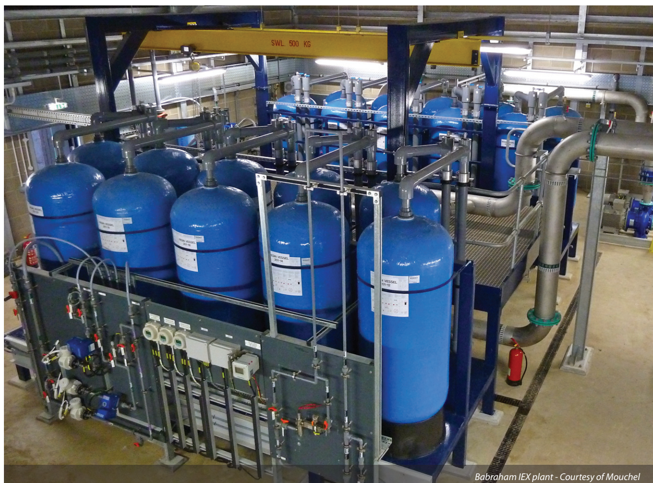
Babraham IEX plant

Cambridge Water Company (CWC) delivers potable water to approximately 300,000 customers spread over an area of 453 square miles in and around Cambridge. The water sources, with a maximum daily license output of 130Mld, are exclusively boreholes drawing water from a predominantly chalk aquifer where nitrate levels have been steadily rising over the past 30 years. This challenge is being met by the construction of ion exchange nitrate removal plants at Babraham, Euston and Fleam Dyke Pumping Stations together with a non-treatment zonal management strategy for Morden Grange Pumping Station. These will enable compliance with the regulatory standards for nitrate concentrations for these sources through to 2035.