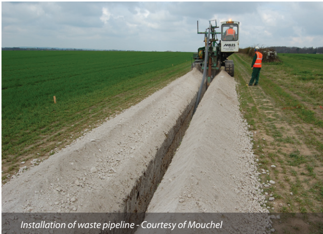
Installation of waste pipeline - Courtesy of Mouchel